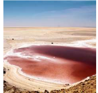
Chott el Jerid