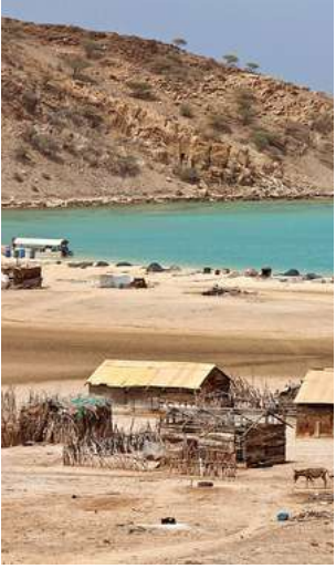
Afar fishing village