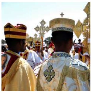
Priests during the Meskel