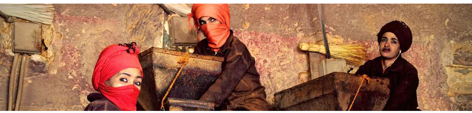
Berberé processing at the Medebar