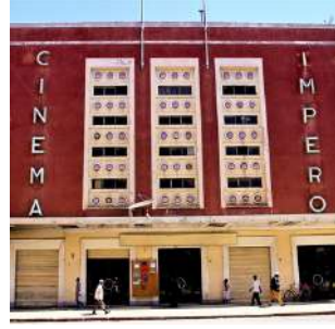
The iconic Empire Cinema in Asmara

*The train excursion is subject to reconfirmation on site, with a minimum of 20 persons for Sunday departure.