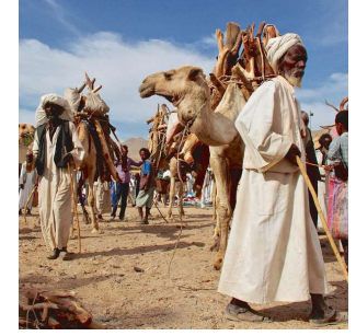
At the Keren market