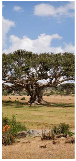
A ficus sycomorus