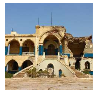
Ruins of the Turkish Imperial Palace