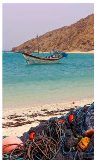
Boat in Dissei