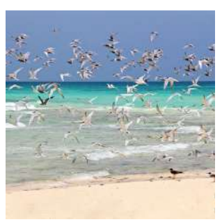
White Dahlak beach

Breakfast at the camp and morning dedicated to walking on the beach and/or snorkelling in the colourful coral reef. Lunch and return to the mainland, continuation to Asmara. In the late afternoon, we complete our visit to 'little Rome' by going to the market, where we can find souvenirs such as jebena (coffee jugs), straw baskets, leather goods, and to the small coffee roasters, where we can buy the fine local coffee. Accommodation at Hotel Crystal or similar. Overnight stay in double rooms with services.