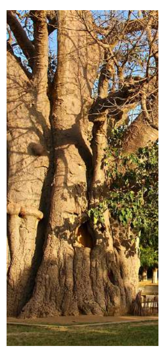
Madonna of the Baobab