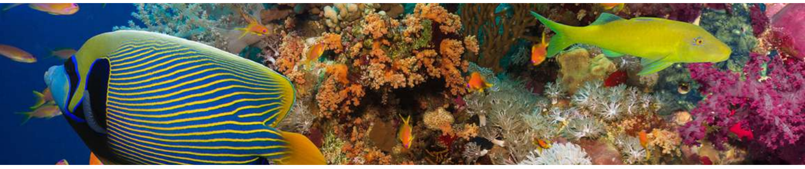
Beautifully coloured backdrops