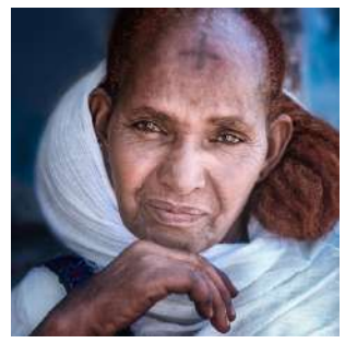
Welcome to Eritrea!

We arrive at Harnet Avenue (formerly 'Corso Italia'), the main artery of the city, along which are concentrated the most interesting examples of Italian Art Deco and Futurist architecture. From an artistic and constructive point of view, Asmara encompasses all the styles of the early 20th century: Cubism, Futurism, Neoclassicism, Rationalism and Expressionism, declined in a pleasant alternation of public and private buildings, which recall the memory of a past that seems to have crystallised in the 1930s.