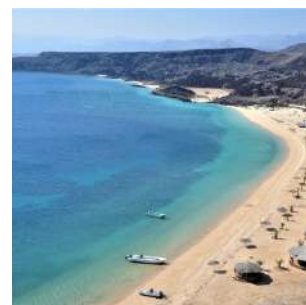
Plage de Sables Blancs