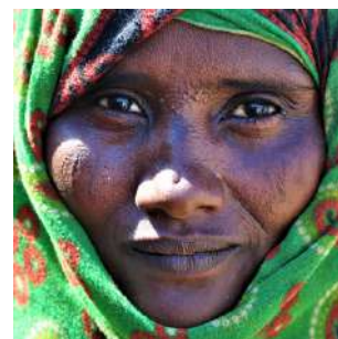
Afar woman in Ardo