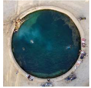
Cleopatra's Baths from above

Breakfast at the hotel and morning dedicated to visiting the SIWA SALT LAKES. Crossing a spectacular road lapped on both sides by the water of the lakes, we reach the recently established salt mining area, which has created a series of brightly coloured "pools" (deep blue, blood red, ...) in which you can swim. Given the high salinity of these waters, you can float effortlessly! We return to the hotel for a shower before heading to the city centre, where we can admire the craftsmen at work and shop in the market area: lamps made of salt and olive wood, dates, olives and extra virgin olive oil, ... Lunch in a restaurant. In the early afternoon EXCURSION IN THE DESERT on the edge of the city, where we can appreciate the soft dunes of the Sahara and the lakes and springs that spring suddenly from its sands. We will wait for the sunset over the dunes before heading to a desert camp for a Bedouin-style candlelit dinner, where we will enjoy meat and vegetables prepared with the zarb, a kind of oven dug under the sand. Return to the hotel, overnight stay in double rooms.