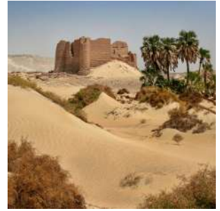
Along the Roman Limes

After breakfast at the camp, time at leisure to appreciate the Labakha fortress at first light. Departure along a difficult sandy track to the site of UMM EL-DABADIB, where there are the remains of the fortress and the most complex underground aqueduct that the Romans built in this region. Continue to the KHARGA OASIS, the southernmost and most populated of the oases, capital of the New Valley Governorate. Inhabited since Neolithic times, the oasis underwent great expansion during the Ptolemaic period, around the 3rd century B.C., and was the crossroads of all the tracks connecting the other oases and the Nile valley. Lunch in a restaurant and accommodation at the Hotel Sol Y Mar Pioneers or similar. Time at leisure for a shower and a refreshing dip in the pool. In the afternoon, visit the ARCHAEOLOGICAL MUSEUM of Kharga, with valuable exhibits including sarcophagi from the Roman period, the IBIS TEMPLE, built during the Persian period under Emperor Darius and dedicated to the god Amun, and the NECROPOLIS OF BAGAWAT, one of the oldest and most important Christian necropolises in the world. Dating back to the 4th century and consisting of 263 mud-brick tombs and a large church, the site features well-preserved paintings depicting Old Testament passages, such as the Chapel of Peace and the Chapel of Exodus, which we will visit. Dinner and overnight stay in the hotel, in double rooms with servants.