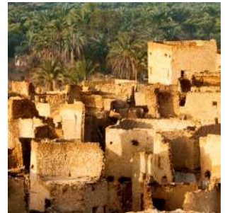
Detail of the Shali ruins