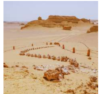
Wadi el Hitan