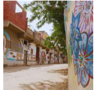
Tunis village murals