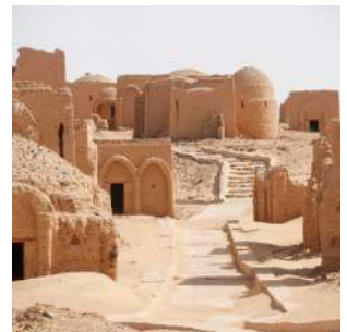
Christian Necropolis of Bagawat