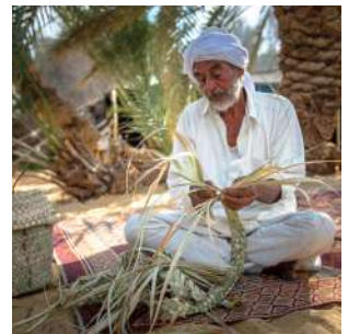
Craftsman in the oasis