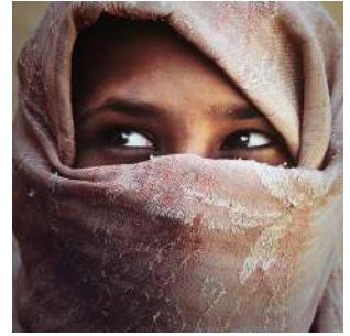
Welcome to Egypt!