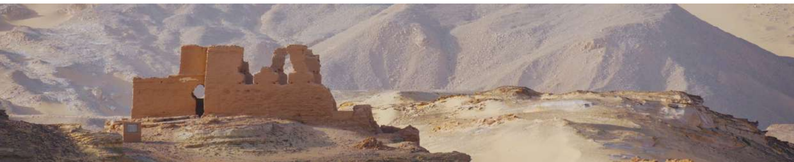
Roman fortress of Labakha

Breakfast at the camp and time at leisure to appreciate the white desert at first light, when it is easy to spot fennecs, the small desert foxes. Afterwards, we set off along a track to the DJARA CAVES, hidden in the middle of the Sahara, in a fissure into which we descend a few metres before entering a large cave with a surprisingly cool climate, and adorned with spectacular stalactites and stalagmites. Picnic lunch in the cave. We then descend south to LABAKHA, a tiny oasis in the middle of an isolated desert landscape, which preserves the ruins of a four-storey Roman fortress, two temples and a vast necropolis. This site along the Limes, the southern border of the Empire, controlled the caravan flow out of Roman Egypt and westwards. Dinner and overnight stay in igloo tents.