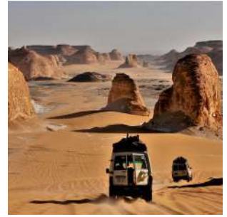
The Aghabat Valley

After breakfast, we depart for the Sahara Saouda, or BLACK DESERT, characterised by a plateau from which rise numerous conical-shaped hills covered with black basalt rocks. We will climb one of these hills to better appreciate the incredible landscape, and to search for the famous star-shaped stones (marcasite). Picnic lunch at El Hayz, near the springs. Next we will visit the Crystal Mountain, which owes its name to the presence of large calcite crystals, before arriving at the AGHABAT (or Aqabat) valley, where we will stop for tea in this magnificent setting. We will then enter the Sahara el Beida, the famous WHITE DESERT, a depression of about 3,000 square kilometres where snow-white rocks, resembling snowy expanses, rise from which rise pinnacles with bizarre and imaginative shapes. These organogenic white limestones were deposited here about a hundred million years ago, during the Cretaceous, when a calm, shallow sea covered this area. They consist of countless shells of microorganisms and unicellular algae that accumulated on the seabed, which once receded, left these limestones exposed to the weathering that shaped these extraordinary natural sculptures. We will admire the sunset in this magical setting, before a candlelight dinner at the camp and an overnight stay in igloo tents.