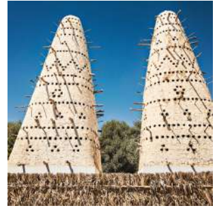
Typical pigeon houses

Breakfast and departure towards the Western Desert until we arrive at WADI EL-HITAN, a UNESCO World Heritage site, known as "the valley of the whales", an extraordinary open-air museum with more than 400 skeletons of ancestors of present-day whales. Walking on the sand, which 40 million years ago was the bottom of the ancient Eocene sea, we will discover the skeletons of two species of archaeocetaceans, the Basilosaurus and the Dorudon, which are particularly interesting because of their tiny hind limbs complete with feet and toes, showing how cetaceans descended from land mammals. We also visit the museum, which not only houses the two best-preserved specimens, but also displays an interesting exhibition on the history of the region. Picnic lunch. We cross the majestic barkane dunes of Qusor Arab, where we stop to fully appreciate the landscape. Arrival at WADI EL-RAYAN and visit the small and unique waterfall in Egypt, created by the difference in height between the upper lake and the lower lake. We will then explore the lakes of this region and the magnificent landscapes that surround it, in particular the LOWER LAKE and the MAGIC LAKE, nestled between the sands of the Sahara. Return to the hotel, dinner and overnight stay.