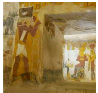
Tomb at Qaret Qasr Selim