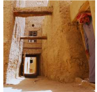
In the alleys of Al Qasr

After breakfast, visit the DEIR EL-HAGAR TEMPLE, dedicated to the gods Amon-Ra, Mut and Khonsu, built during the reign of Nero (54-68 A.D.) and embellished with valuable bas-reliefs during the reigns of Vespasian, Titus and Domitian. We continue to the MUZAWAKA NECROPOLIS ('well decorated'), which consists of a series of over 300 tombs, some of which have perfectly preserved the paintings in their original colours, such as those of the officials Petosiris and Petubastis, which we will visit. The main themes typical of the tombs of Pharaonic Egypt are present, but they are depicted in a Greco-Roman style. Departure northwards, with a stop at Abu Minqar for a picnic lunch. Late afternoon arrival at the BAHARIA OASIS, which has always been a focal point of caravan routes in the Western Desert between the Nile Valley and Libya. We will travel to the top of GEBEL EL-ENGLIZ, where we will see the remains of a fort built by the British during the First World War and admire the sunset from above. Traditional dinner in a private house, where we can enjoy local specialities such as kofta, lamb meatballs, shish tawooq, marinated chicken skewers, molokhia, a kind of mallow soup accompanied by rice, sambusek, puff pastry rolls filled with meat or vegetables, full, broad bean stew... Accommodation at Hotel Alya or similar, overnight in double rooms with services.