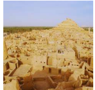
View of Shali