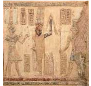
High reliefs at Deir el-Hagar