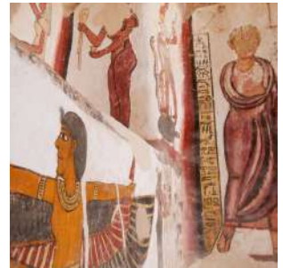
Paintings in a Muzawaka tomb