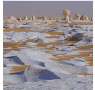
The White Desert