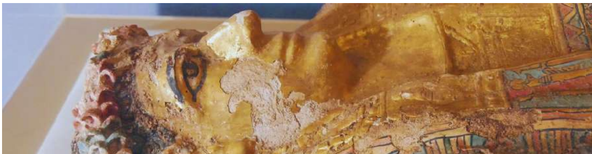
Museum of the Golden Mummies