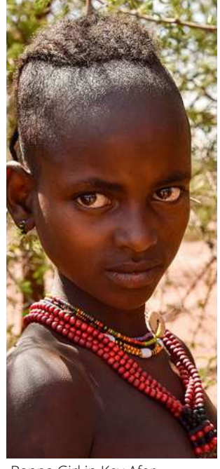
Banna Girl in Key Afer

After breakfast, visit the ethnographic museum in Jinka, where we will find everyday objects from the various ethnic groups of the lower Omo valley. Afterwards, depart for the picturesque KEY AFER weekly MARKET, where Banna, Tsemay and Ari people flock to the town, mainly to exchange livestock. Lunch in a local restaurant or lunch box. Continuation and participation in the KONSO WEEKLY MARKET, characteristic for the embroidered fabrics used by the women of this ethnic group for their skirts, and a visit to the KONSO VILLAGES, declared a UNESCO World Heritage site, characteristic for their terraces with mixed crops, the stone walls that enclose them forming veritable labyrinths, the generation posts and for the wagas, carved wooden sculptures in honour of deceased warriors, pillars of the ancestor cult practised by this population (visible almost exclusively in the museum). Accommodation at Kanta Lodge or similar and overnight stay in a double room with services.