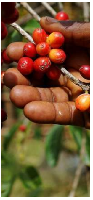
The famous Ethiopian coffee

Arrive at the destination airport in the morning.