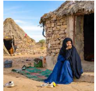
Graret Levrass village