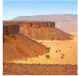
Landscapes around M'Haireth

Breakfast and departure for the M'HAIRETH oasis, crossing the most beautiful landscapes in Mauritania. Arrival at TERJIT, a wonderful oasis nestled in a canyon, where you can cool off in a small natural pool formed by two springs gushing from the rock, one hot and one cold, and relax while sipping mint tea in the palm grove. Picnic lunch. Continue along a track to Bennichab. Dinner at the camp prepared by our cook and overnight stay in a traditional Mauritanian tent (khaima) or igloo tent.