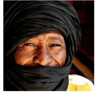
Welcome to Mauritania!

After breakfast, depart in the direction of Atar via the IRICH VALLEY, a place favoured by nomads due to the presence of numerous acacias and grasses for camels and goats, and the lush GLEITAT millstone. We continue to the TIVOUJAR Pass, where we enjoy a magnificent view of the surrounding landscape of rocks and sand. We descend on foot along the walls to reach a shady spot in the canyon where we will have a picnic lunch. In the afternoon, we continue along the WHITE VALLEY, where the dunes give way to rocky formations resulting from erosion and the palm groves are green patches contrasting with the surrounding aridity. Rejoin the tarmac road at Amatil and, on arrival in ATAR, visit its market and accommodation at the Auberge Les Toiles Maures or similar. Dinner and overnight stay in a tent/double bungalow with shared bathrooms reserved for our group.