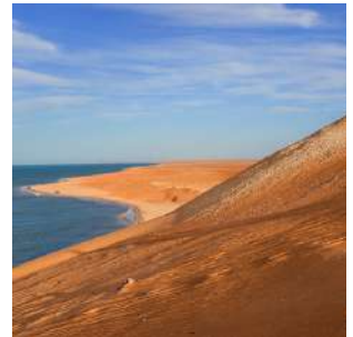
Between the desert and the ocean

After breakfast we will head along the ATLANTIC COAST, following the rhythms of the tides, to NOUAMGHAR, inside the BANC D'ARGUIN park, to admire the colony of pink flamingos and other migratory species that often inhabit the lagoon. Return along an asphalt road in the direction of the capital. Lunch at Les Sultanes Chez Nico or similar restaurant by the sea, where we can enjoy fresh fish. This was followed by a visit to the most significant places in NOUAKCHOTT, the craft shops and the port de peche, the bustling fish market. Day use rooms on request. Transfer to the airport, end of services.