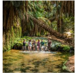
In the oasis of Terjit

After breakfast, we depart along the track to MHAIJRAT, a fishing village, where we meet the Imraguen women dedicated to drying fish and producing roe. We continue on to magnificent dunes jutting into the ocean, where we set up our tented camp. Picnic lunch en route. In the afternoon, time at leisure for a refreshing swim or a walk along the coast. Dinner at the camp prepared by our cook and overnight stay in a traditional Mauritanian tent (khaima) or igloo tent.