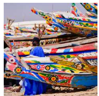
Pirogues in Nouakchott