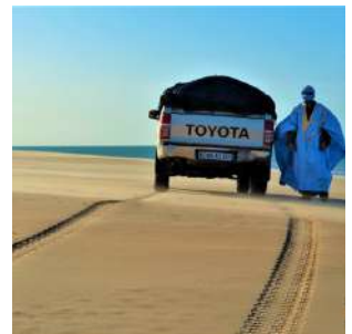
Along the Atlantic coast