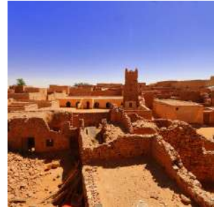
The Chinguetti Mosque

Breakfast at the Auberge and departure in the direction of Chinguetti, penetrating the mountainous reliefs of the Adrar (adrar, from the Berber word for "mountain") as far as the AMOGJAR Pass, where we will be able to see the SAGANNE FORT, used for the filming of a famous film on colonisation, and the AGROUR ROCK PAINTINGS. These original paintings, eroded by time and wind, show us how millions of years ago these now arid lands were a lush savannah inhabited by elephants, antelopes, lions, giraffes, ... Picnic lunch. Arrival at the ancient caravan city of CHINGUETTI, the seventh holy city of Islam declared a UNESCO World Heritage Site. We will wander through the citadel's alleyways, discovering its famous stone mosque (exterior) and libraries containing ancient manuscripts. Then departure for the majestic dunes of the ERG OUARANE at the entrance to the city (in 4x4 or on a camel) to admire the sunset. Accommodation at the Auberge des caravanes or similar, dinner and overnight in a double room with services.