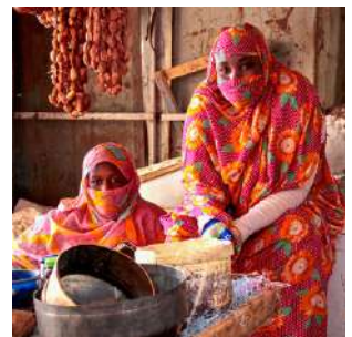
Date sellers in Atar