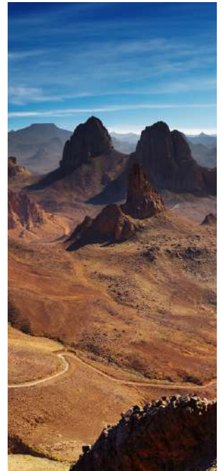
The 'end of the world'