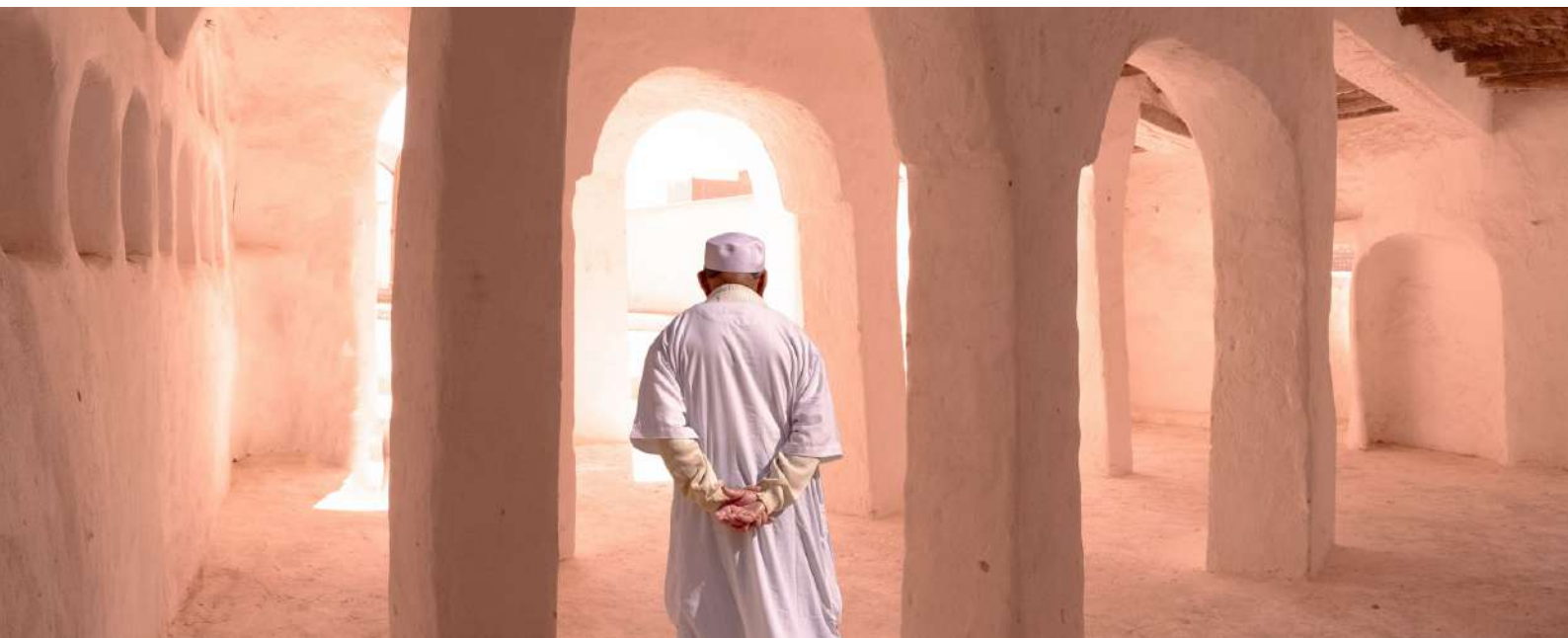
In the mosque of Ghardaia

Breakfast at the hotel and end of visits to the Ibadite pentapolis. If time permits, excursion to EL GOLEA, famous for its fort and the tomb of Father Charles de Foucaould. Lunch and dinner in a restaurant or hotel. Transfer to the airport in time for the Air Algerie flight to Tamanrasset. On arrival, accommodation at the Hotel Khoja or similar, overnight in a double room with services.