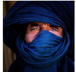
Welcome to Algeria!

Breakfast at the hotel and visit of ALGERI (from the Arabic El Djezair), declared a UNESCO World Heritage Site, with its whitewashed houses, overlooking the Mediterranean and surrounded by verdant, fertile hills. This historic city was first the most powerful of the corsair bases in Barbary in the time of the pirate Barbarossa, then dominated by the Ottomans for three centuries, and later a residential centre during the French colonial period. We will begin with a stroll through the medina of ALGERI, built on the ruins of ancient Icosium: we will wander through the labyrinthine alleyways of the kasbah, most of which dates back to the 16th century, and admire the numerous mosques (exterior) and historic residences known as dar (exterior). We will then continue along the waterfront, where the architectural imprint of the French period is clearly visible, with large tree-lined avenues, arcades, and elegant buildings. Seafood lunch in a restaurant. Transfer to the airport in time for the Air Algérie flight to Ghardaia. Upon arrival, transfer to Hotel Les deux tours or similar. Dinner and overnight in a double room with services.