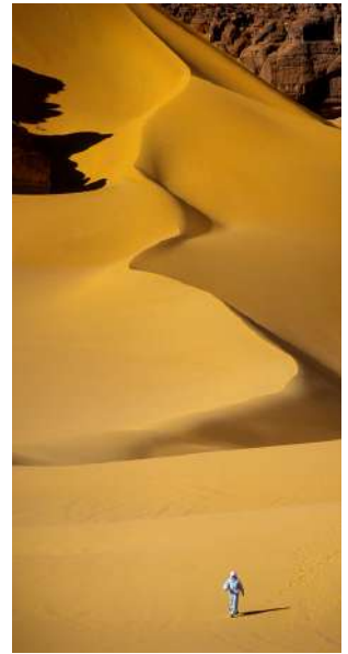
The Wonders of Tadrart

Early morning flight to Djanet, on arrival rooms at disposal at the Hotel Grotte des Ambassadeurs or similar, overnight stay. Breakfast at the hotel and departure for the desert. Days dedicated to the exploration of TADRART, described as "the most beautiful desert in the world", a fascinating corner towards the border with the Niger, against a backdrop of dunes ranging from yellow to orange and rocks shaped by erosion to create imaginative and bizarre shapes. We will visit IN DJAREN with its cliffs decorated with rock carvings and paintings, the labyrinth of 'fairy chimneys' at MOUL N'AGA, the famous red dunes of TIN MERZOUGA and the white dunes of ERG ADMER. In addition to the spectacular landscapes, we will meet families of NOMADI TUAREG, with whom we can exchange greetings and enjoy the famous desert tea together. Breakfasts, lunches and dinners at the camp prepared by our cook, overnight stays in double igloo tents.