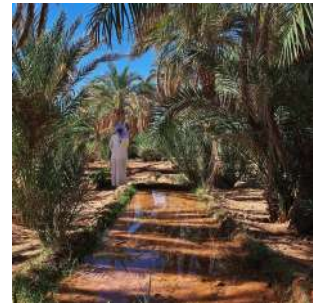
Canals in the palm grove