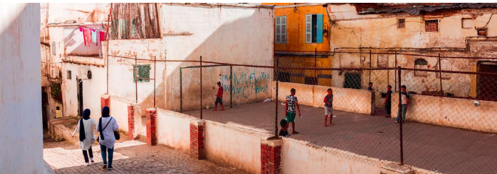
View of the medina in Algiers