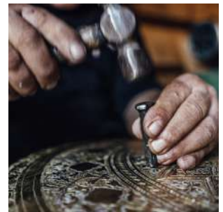
Craftsman at work