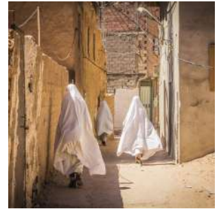
View of Ghardaia