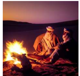
At the camp