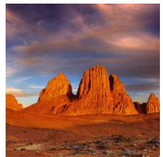
Sunset on Assekrem

Breakfast at the hotel and end of visits on TAMANRASSET. Transfer to the airport in time for the Air Algerie flight to Djanet. Lunch box lunch. Departure by 4x4 to the SAHARA DESERT where we will begin our visit with the most famous rock art site in the area at TAGHARGHART, that of La Vache qui Pleure (the weeping cow), a work of some 6,000 years ago depicting three long-horned cattle with tears streaming from their eyes. Continuation to the ERG ADMER. Dinner prepared by our cook and overnight stay in double igloo tents.