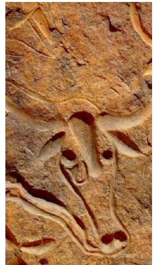
La Vache qui Pleure