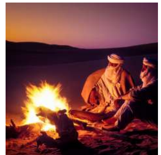
Dinner around the fire with the Tuaregs