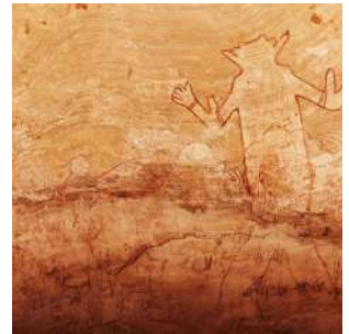
'God of Sefar'

Arrival in ALGIERS to coincide with your return flight. End of services.