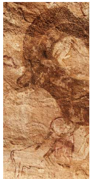
Mouflon in Tan Zoumaïtak