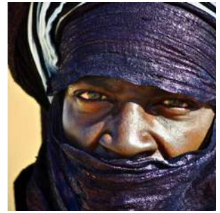
Welcome to the Algerian south!

Flight to Algiers, formalities upon arrival. Transfer to the national terminal for the Air Algerie flight towards Djanet (scheduled at 22h15). On arrival meeting with Kanaga Africa Tours staff and accommodation at the Grotte des Ambassadeurs hotel or similar, overnight in double room with services.