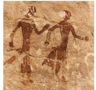
"African Women" in Tan Zoumaïtak

Days are dedicated to the exploration on foot of the TASSILI N'AJJAR, an incredible open-air museum with more than 15,000 depictions, including rock paintings and graffiti. Arrival in TAMRIT, where we can admire the oldest cypress trees in the world, which have managed to survive thanks to the microclimate and bear witness to when the Sahara was a verdant region covered with rivers and forests. This beautiful area is characterised by rocky columns up to 20 metres high, with valuable paintings. We will admire TAN ZOUMAITAK, the first station to be discovered by Henry Lothe in 1956, where the largest number of paintings from the so-called 'Round Head' period (the 'African women' are famous) can be found. We continue to IN ITINEN, passing through a spectacular scenery of rocks sculpted by erosion, with a large concentration of wall art covering various prehistoric periods, including the depiction of a four-metre elephant and so-called 'justices of the peace'.