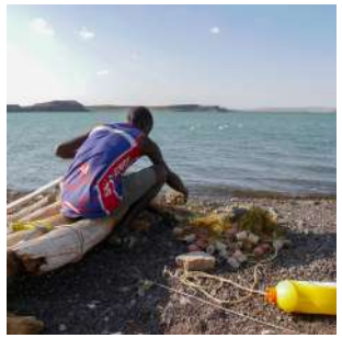
Fisherman on his raft