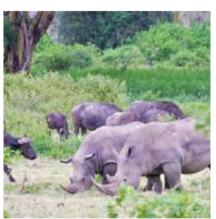
Rhinos in Nakuru Park