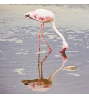
Flamingo in Nakuru Park