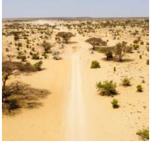
Along desert tracks