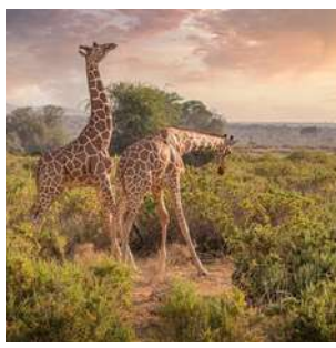
Reticulated giraffe in Samburu

At dawn, after a quick breakfast, safari in the park in search of, among others, elephants watering along the banks of the Ewaso Ngiro River. Return to the lodge for breakfast and onwards. Leaving the reserve, near Archer's Post, we will take a dirt road that will lead us towards the semi-nomadic camps of the SAMBURU or Lokop shepherds. They are a Nilotic group dedicated to raising zebu, sheep, goats and dromedaries, closely related to the Maasai, and they speak a very similar language. Here we will visit a manyatta, a group of circular huts built of wood, mud and cow dung, and admire the women's striking necklaces, made of coloured beads sewn onto leather, and the copper bracelets on their wrists and ankles. We will watch dances and, with a bit of luck, may even meet the Samburu warriors.