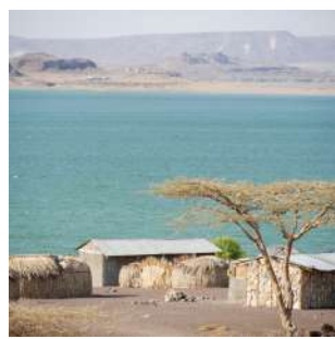
El Molo Village