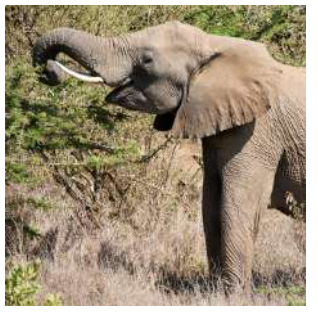
Elephant, Mugie Conservancy