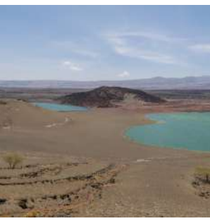
Climbing the Nabuyatom

Breakfast at the lodge, during which we can admire the fauna present in the park (zebras, warthogs, monkeys, etc.). Depart for Lake Baringo, passing through the Mugie Conservancy, a protected area bordering the main road where, with a bit of luck, it will be possible to encounter elephants. Lunch box lunch. Visit to a POKOT village, a Nilotic group present in this part of Kenya and in the Karamoja region of Uganda. Devoted to pastoralism and agriculture, they live in oval huts of wood and thatch in the savannah. We are amazed at the women's accessories, in particular the large circular necklaces. Continue to Nakuru, accommodation at Punda Milia Camp, dinner and overnight in a double room with private facilities.