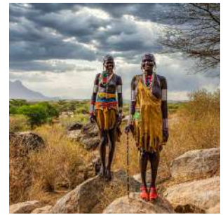
Landscapes of the Boya Hills