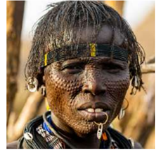
Jiye woman with scarification