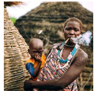
Toposa woman with a pipe