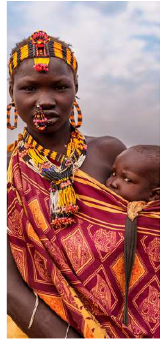
Welcome to South Sudan!

Breakfast at the hotel and transfer to TORIT. Clearance of formalities and on to the LOTUKO KINGDOM, a people who settled in the area in the 15th century, becoming sedentary and living off agriculture, livestock and fishing. Their economy and spirituality revolves around the cyclical nature of the seasons, in which the figure of the chief witch doctor, who officiates at propitiatory rites for the abundance of rain and harvests, is of particular importance. Picnic lunch en route. First visit to the village, where we will also have time to admire the sunset. Dinner prepared by our cook and overnight stay in double igloo tents.