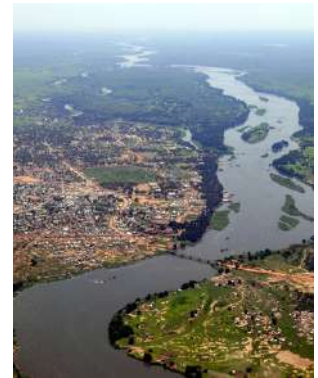
Juba and the White Nile