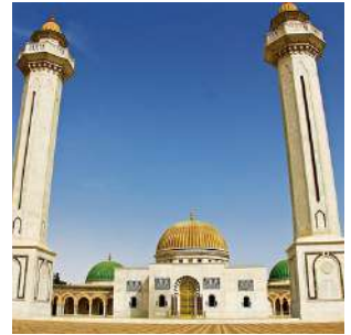
Mausoleum of Habib Bourguiba