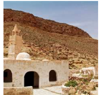
Chenini Village and Mosque

Breakfast and departure for CHENINI, a beautiful hilltop village with a still-used ksar (fortified granary) and a beautiful whitewashed mosque, and the tombs of the 'seven sleepers', strange five-metre burial mounds. Continuation to DOURET, another spectacular Berber village. Lunch in a restaurant. In the afternoon, we visit KSAR OULED SOLTANE and KSAR EZZAHRA, to admire the groups of ghorfas (fortified granary chambers), where olive oil and wheat were stored by the Berber populations, who in ancient times used these granaries as banks. Upon arrival in TATAOUINE, opportunity to taste corne de gazelle, a typical city sweet filled with nuts and honey, and accommodation at the Sangho Privilege Hotel or similar, dinner and overnight in a double room with services.