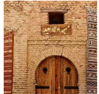
Alleys of Tozeur