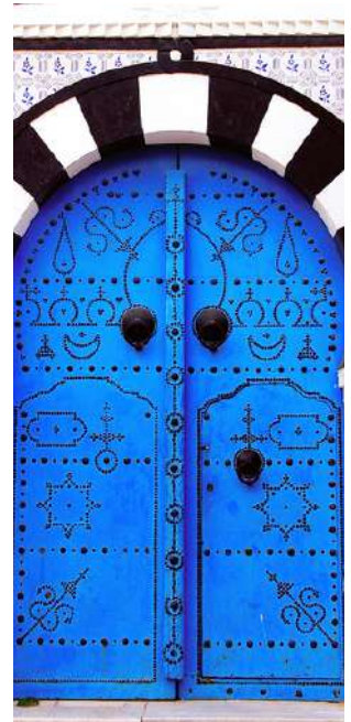
Welcome to Tunisia!

Flight to Tunis, arrival in the morning and meeting with Kanaga Africa Tours staff, assistance in changing Euros and possible purchase of a local phone card. Lunch in a restaurant. In the afternoon, stroll through the medina of TUNISI (UNESCO heritage site), discovering its souks (markets), for endless haggling over carpets, fabrics, dried fruit and spices, and a visit to the Zitouna mosque (exterior) or 'mosque of the olive tree', one of the most important mosques in Islam, built in 732 AD. and rebuilt in the 9th century, the Hammouda Pacha mosque (exterior), with its distinctive minaret, the finely decorated madrasas (Koranic schools), including the Slimania madrasa, and the late 19th century cathedral. We also climb onto a panoramic balcony for a view of the entire medina and the Zitouna mosque, and visit the modern kasbah square where the Bay palace, the town hall and the kasbah mosque stand out. Accommodation at the Hotel Carlton or similar and overnight stay in a double room with services.