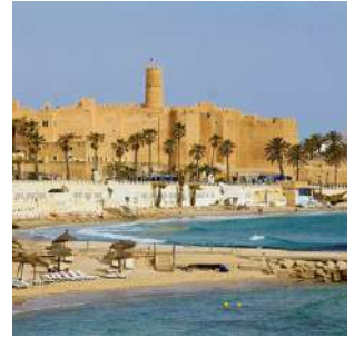
View of the ribat of Monastir

After breakfast, visit MONASTIR: the panoramic view of the ribat, an Islamic fortification dating back to 796 AD, and the monumental mausoleum of Habib Bourguiba, father of the country, made of arches and green domes. Then transfer to SOUSSE, visit its archaeological museum dedicated to Roman mosaics. Lunch in a restaurant. In the afternoon, we visit the medina, a UNESCO heritage site: the intricate alleyways punctuated by 24 small mosques, the covered souk with all kinds of merchandise, the Grand Mosquée, peculiar for not having a minaret, and the ribat, where from the top of its nador (watchtower) we admire magnificent views of the city and the port. Continuation northwards to Hammamet, accommodation at the Hotel Sentido Le Sultan or similar, directly on the beach and overnight stay in a double room with services.