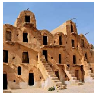
Ghorfas of ksar Ouled Soltane