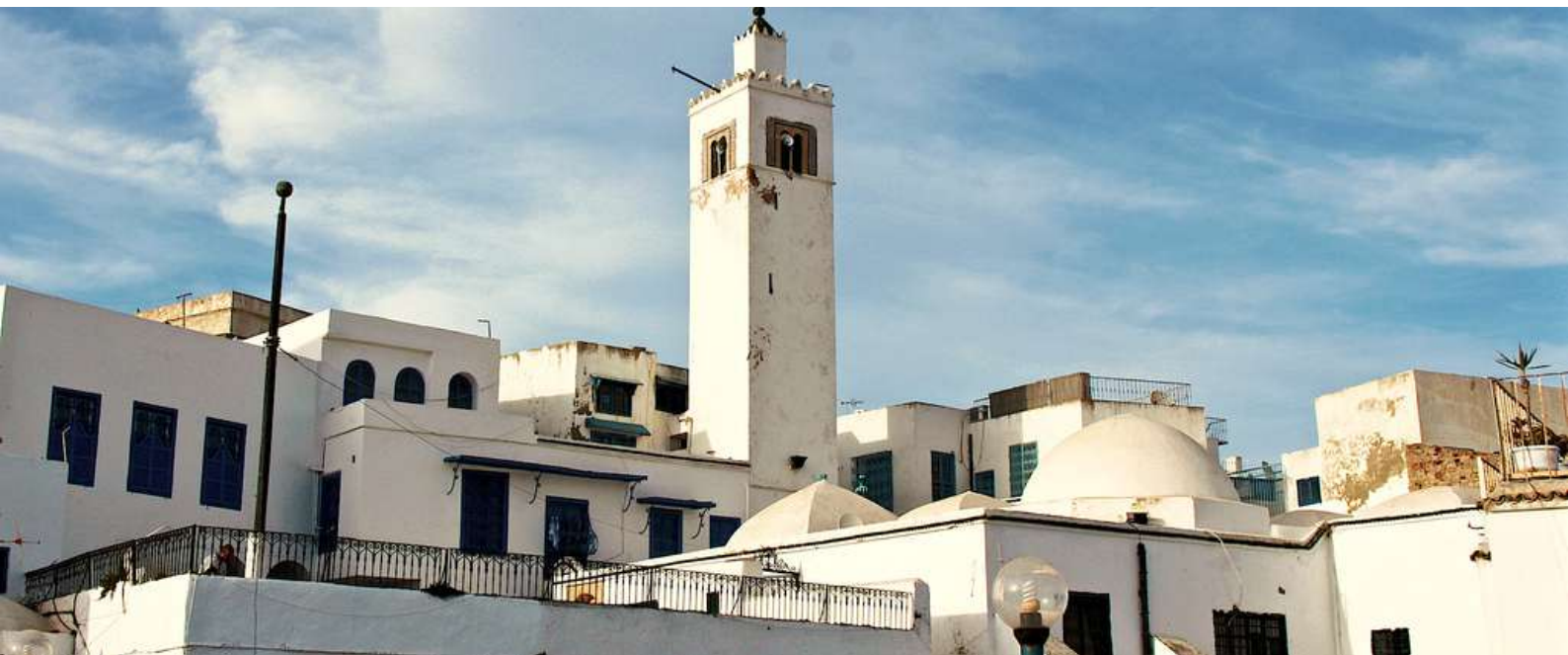
Village of Sidi Bou Said

After breakfast, departure for the village of SIDI BOU SAID, one of the most picturesque corners of the country, with its blindingly white houses punctuated by blue doors and colourful bougainvilleas, situated on the top of a cliff offering magnificent views of the Gulf of Tunis. Stroll through the narrow streets of the village, with a stop to enjoy the famous mint tea with pine nuts. Lunch in a restaurant and transfer to Tunis airport in time for your return flight. End of services.