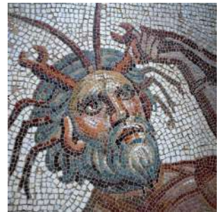
Sousse Archaeological Museum