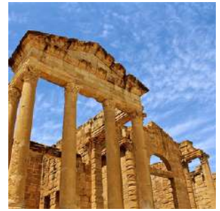
Roman temples of Sufetula

Breakfast and departure for the Saharan regions with a stop en route at the Roman-era site of SUFETULA (Sbeitla), unmissable for the Antonine Gate and the well-preserved temples of Jupiter, Juno and Minerva. Continuation to Gafsa and lunch in a restaurant. In the afternoon, excursion to NEFTA to the vantage point from where you can admire the Corbeille, a deep palm-covered depression that bisects the city. Continue to ONG JEMAL to visit an old set from the Star Wars film and to watch the sunset in the desert (if time does not permit, the visit will take place the following morning). In Tozeur, accommodation at the Hotel Ras el Ain or similar and overnight stay in a double room with services.