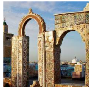
View of the Zitouna Mosque

After breakfast, departure for the holy city of KAIROUAN (UNESCO heritage site): visit to the Great Mosque, originally built in 670 A.D. and therefore the oldest in the whole of Africa, with its marble courtyard and a portico supported by columns typical of Aghlabite architecture, the medina, with its white walls interspersed with blue doors, the Bir Barouta, a well where water is extracted by the motion of a camel (water that is thought to be miraculous because it is linked to the source of the Zem Zem well in Mecca), the carpet museum, to get a closer look at this typical art of the city, the Sidi Sahab mausoleum, also known as the 'barber's mosque', because it houses the prophet Mohammed's beard hair, and the Aghlabite basins, cisterns dating back to the 9th century. Lunch in a restaurant. Accommodation at the historic Hotel Continental or similar and overnight stay in a double room with services.