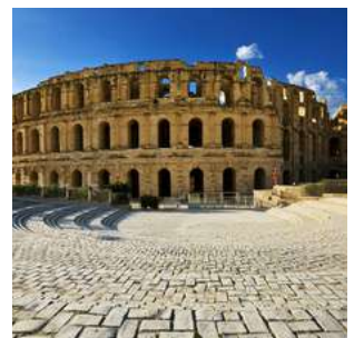
El Jem Amphitheatre

After breakfast, departure for KSAR HADDADA and a visit to its fortified granary, and to MATMATA where we will admire the troglodyte houses, underground dwellings that served to escape the torrid summer heat, where the rooms opened radially from the bottom of a circular well 5 to 10 metres deep. Lunch in a restaurant. In the afternoon, transfer northwards with a stop at EL JEM to admire the amphitheatre of the ancient Roman city of Thysdrus, built around 200 years AD, the third largest in the Romanised world and the largest in Africa, declared a UNESCO World Heritage Site. Arrival in Monastir, accommodation at the Hotel Regency or similar, located directly on the beach and overnight stay in a double room with services.