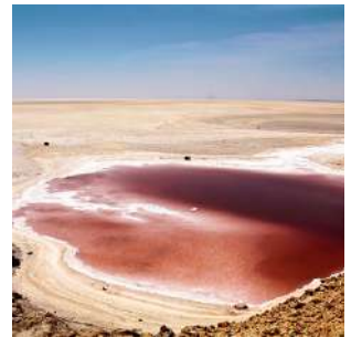
Chott el Jerid