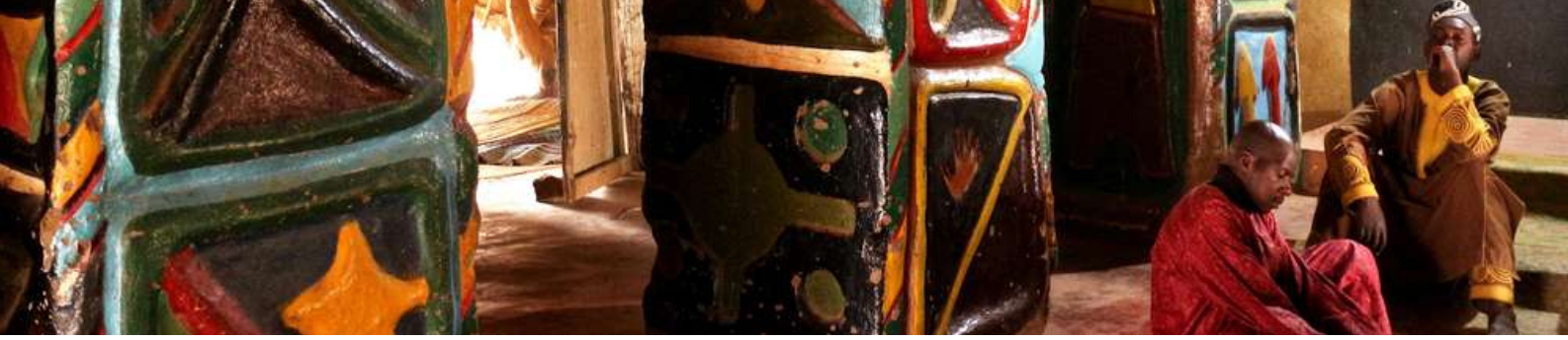
Lamidat of N'Gaoundere