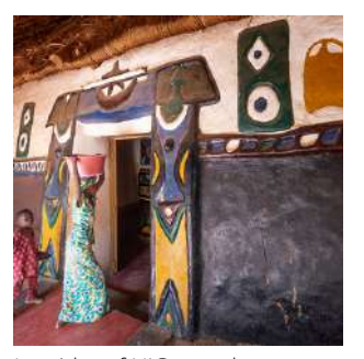
Lamidat of N'Gaoundere

Morning arrival at the YAOUNDE' station, transfer to Hotel Merina or similar. Lunch in a restaurant and afternoon city tour of YAOUNDE', the capital of the country, with the interesting National Museum and the Museum of Forest Peoples. Overnight stay in a hotel, in double rooms with services.