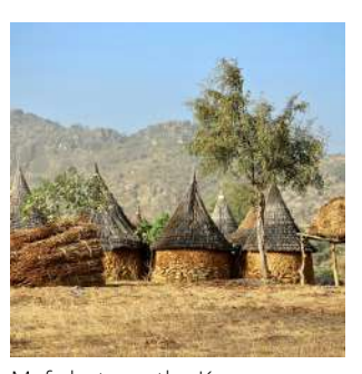
Mafa huts on the Koza pass