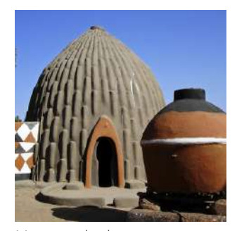
Musgum clay house