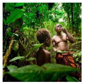
Activities in the forest