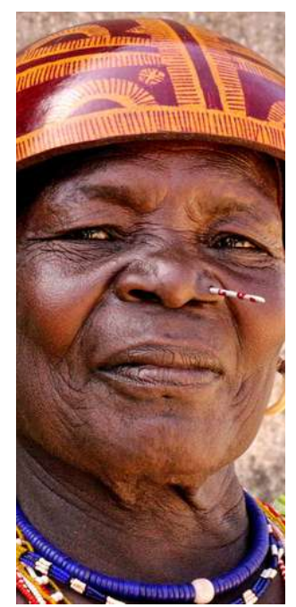
Hidé woman in Tourou