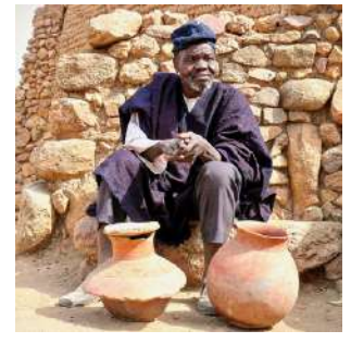
Sorcier aux crabes