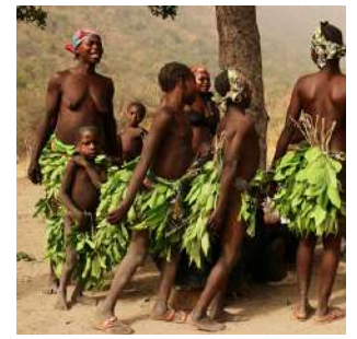
Dance from the Koma