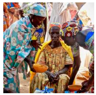
At the Pouss market