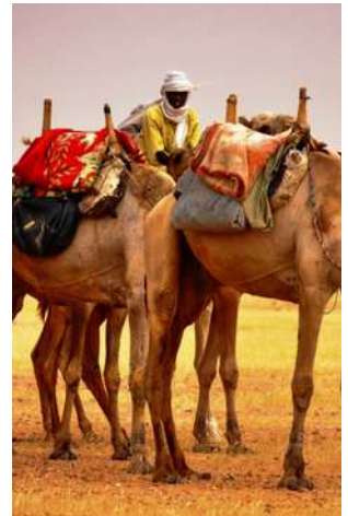
Nomads at the well