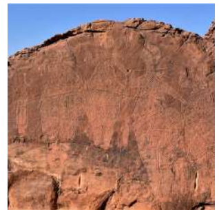
The 'maidens' of Niola Doa