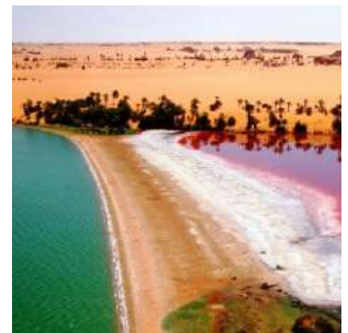
Lake Ounianga Kebir