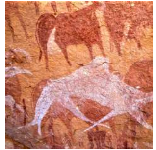
Terkei rock paintings