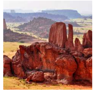
Expedition to Ennedi