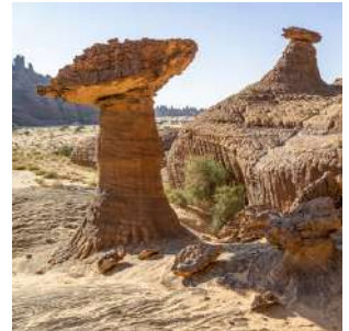
Bizarre Ennedi formations