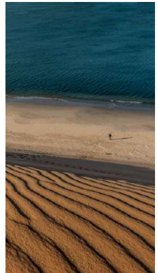
Between the desert and the ocean...

After breakfast we continue our journey on a paved road in the direction of the capital. Lunch at Les Sultanes Chez Nico or similar restaurant by the sea, where we can enjoy fresh fish. Arriving in NOUAKCHOTT, visit the port de peche, the bustling fish market, to see the colourful fishing boats returning to the beach. Day use rooms on request. Transfer to the airport, end of services.