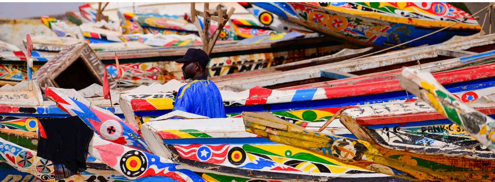
Dugouts on Nouakchott beach