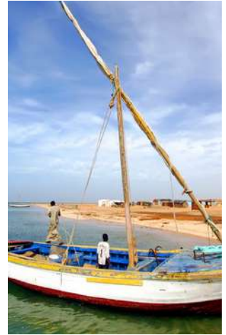
Sailing boat in the Banc d'Arguin

*Excursion subject to weather conditions, in particular the state of the tide and wind.