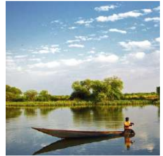
On the Casamance River

After breakfast, departure for Toubacouta, in the heart of SINE'-SALOUM. Crossing the border into The Gambia and city tour of the capital BANJUL, including its bustling market. We cross the river by barge, cross the border and continue to TOUBACOUTA, where we take a boat trip to admire the mangrove habitat, an opportunity to observe numerous bird species such as cormorants and kingfishers. With a bit of luck, it will also be possible to spot the rare dolphins and manatees that inhabit this area or to meet the women harvesting oysters. Accommodation at the Hotel Keur Saloum or similar, dinner and overnight in a double room with services.