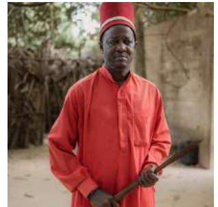
King of Bobedioum

After breakfast, we depart for JOAL visiting FADIOUT, an island formed entirely of shells, where we admire the Cathedral, a splendid view of the granaries on stilts and the colourful mixed Muslim and Christian cemetery, a great example of religious tolerance. Lunch in a restaurant. In the afternoon, we continue to LA SOMONE, a village between the lagoon and the sea, which lies on one of the most beautiful beaches on the Petite Cote. Accommodation at the Hotel Phoenix or similar and overnight stay in a double room with services.