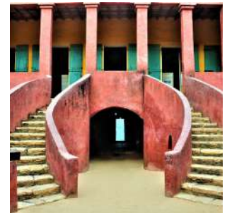
Maison des Esclaves

* Lake Retba, or 'Pink Lake', is flooded at the time of writing, so neither its pinkish colour nor the work of the salt extractors can be appreciated.