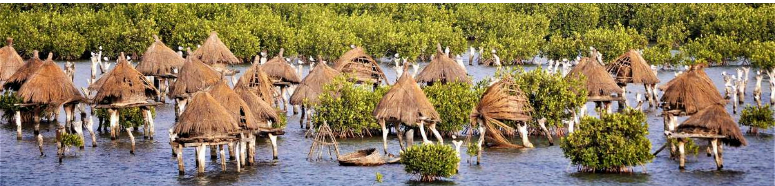
Barns on stilts