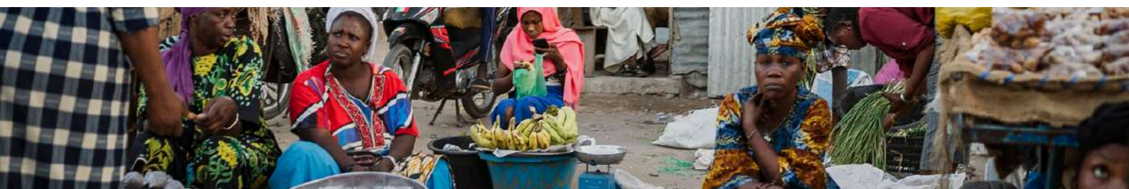
At the Kaolack market