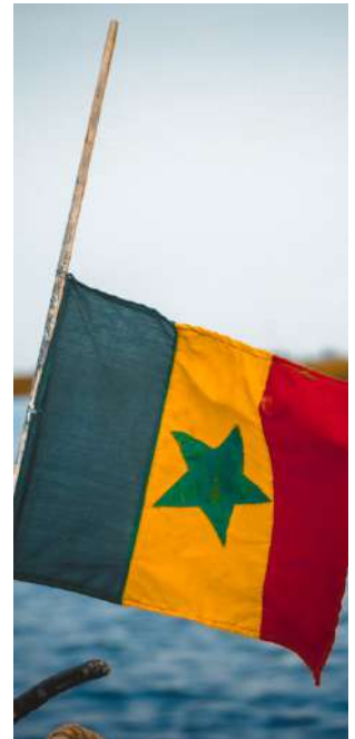
Welcome to Senegal!

Early in the morning, after breakfast, we set off in a northerly direction to visit the DJOUDJ BIRD PARK, one of the best places in the world for birdwatching, where we will make an excursion in a dugout canoe to admire a huge number of species, such as pelicans, cormorants and fish eagles. Return to SAINT-LOUIS and lunch of thiébou-dieune, the national dish, rice cooked in tomato sauce and served with fried fish. In the afternoon, visit of the colonial city, a UNESCO World Heritage site, by horse-drawn carriage: the Faidherbe square, the governor's palace (exterior), the Guet N'Dar fishermen's quarter, the fish market, teeming with activity, and the craft and art ateliers, where you can find splendid sculptures and paintings. Overnight stay in a hotel.