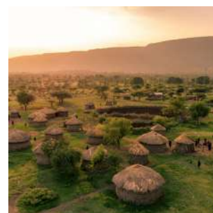
Masai village at sunset