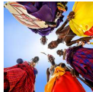
Welcome to Tanzania!

After breakfast we depart north to the Kenyan border to the town of Longido. From here a comfortable track through volcano-dotted savannah will take us to the Maasai village of ENGARESERO, at the foot of the monumental Ol Doinyo Lengai volcano, which will be our base for exploration over the next few days. Accommodation at Giraffe Masai Lodge, lunch and relaxation in its spring water pool. In the afternoon, the first exploration of the area on foot, among boma (groups of huts) of the Maasai ethnic group and Maasai giraffes ( Giraffa camelopardalis tippelskirchi ) characteristic for their serrated-edged spots. For those who wish, it will be possible to make a trek (about 1h30/2h00 round trip) to the Engaresero waterfalls, on a route that follows the bed of the river of the same name (which on several occasions must be forded) through wide gorges that lead to a mighty waterfall and a natural pool at its foot, where you can bathe or simply cool off. Return to the lodge, dinner and overnight stay in en-suite double rooms.