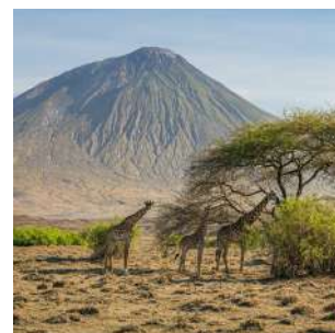
Giraffes under the Ol Doinyo Lengai volcano