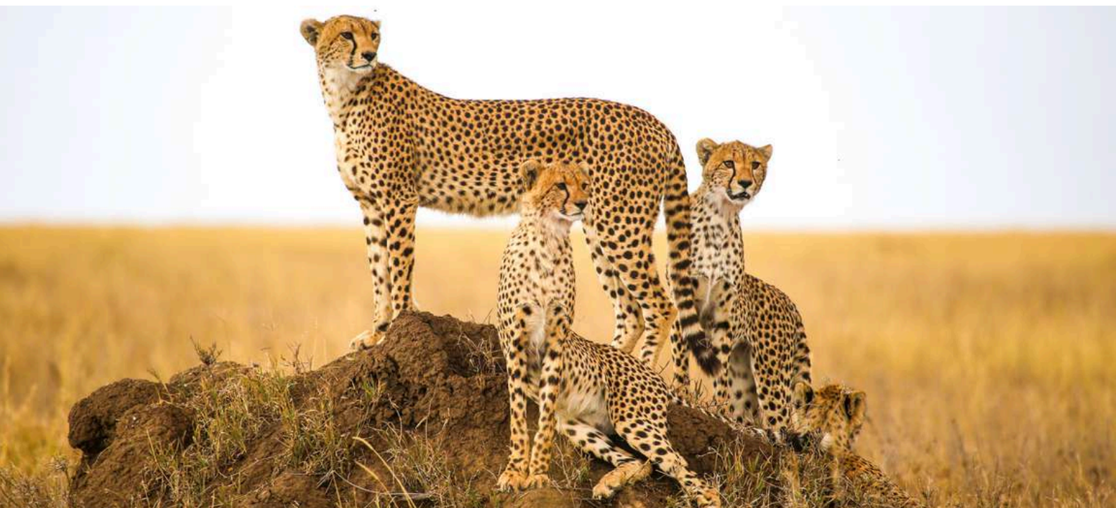
Cheetahs in the Savannah