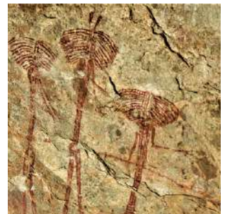
Rock paintings in Kolo