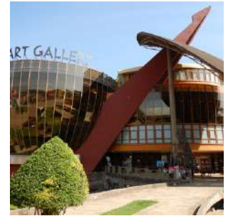
Cultural Heritage Centre in Arusha