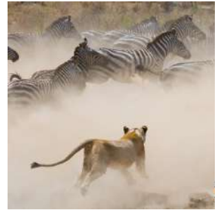
Lioness on the hunt