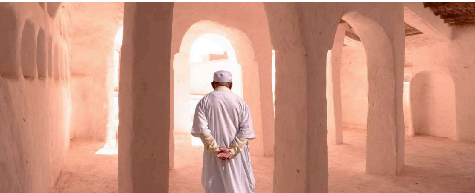
In the mosque of Ghardaia

Breakfast at the hotel and end of visits to the Ibadite pentapolis. If time permits, excursion to EL GOLEA, famous for its fort and the tomb of Father Charles de Foucauld. Lunch and dinner in a restaurant or hotel. Transfer to the airport in time for the Air Algérie flight to Tamanrasset. On arrival, accommodation at the Hotel Khoja or similar, overnight in a double room with services.