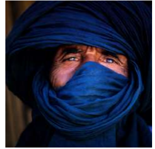
Welcome to Algeria!

Breakfast at the hotel and visit of ALGERI (from the Arabic El Djezair), declared a UNESCO World Heritage Site, with its whitewashed houses, overlooking the Mediterranean and surrounded by verdant, fertile hills. This historic city was first the most powerful of the corsair bases in Barbary in the time of the pirate Barbarossa, then dominated by the Ottomans for three centuries, and later a residential centre during the French colonial period. We will begin with a stroll through the medina of ALGERI, built on the ruins of ancient Icosium: we will wander through the labyrinthine alleyways of the kasbah, most of which dates back to the 16th century, and admire the numerous mosques (exterior) and historic residences known as dar (exterior). We will then continue along the waterfront, where the architectural imprint of the French period is clearly visible, with large tree-lined avenues, arcades, and elegant buildings. Seafood lunch in a restaurant. Transfer to the airport in time for the Air Algerie flight to Ghardaia. Upon arrival, transfer to Hotel Les deux tours or similar. Dinner and overnight in a double room with services.