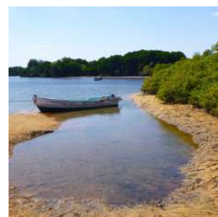
Mangrove habitat in Godoria

After breakfast, transfer to OBOK, a town from which French colonialism began and which preserves vestiges of the era such as the governor's house and the navy cemetery. We also visit the RAS BIR lighthouse and the beautiful mangrove area of GODORIA, where we take a boat trip. Lunch box and return to Tadjoura. Departure by ferry (approx. 1h00) across the gulf to the capital (times are random, in case we return by land). On arrival in the capital, accommodation at the Hotel Menelik or similar, dinner in a restaurant and overnight in double rooms with services.