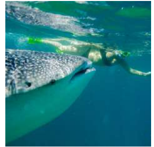
Snorkelling with whale sharks