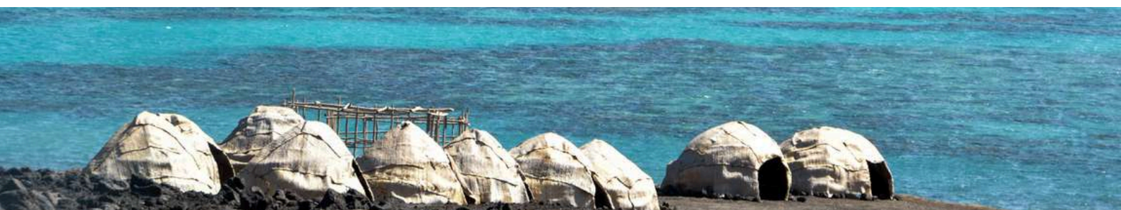
Ghoubbet and Devil's Island

* During the trek there will be Afar porters with their dromedaries. Those who do not wish to do the trek on foot can continue by 4x4 to Lake Assal with the drivers.