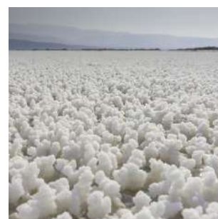
Evaporites on Lake Assal

* During the trek there will be Afar porters with their dromedaries. Those who do not wish to do the trek on foot can continue by 4x4 to Lake Assal with the drivers.