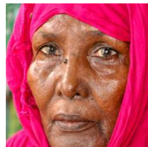
Through the streets of the African quarter