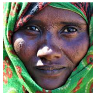
Afar woman in Ardo