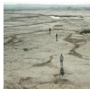
Surreal landscapes of Lake Abbé