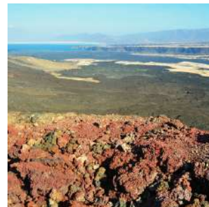
Ardoukoba volcanic zone

After breakfast, exploration of the GHOUBBET area, with breathtaking viewpoints. It is in this area that the three great fracture systems of the earth's crust meet (Red Sea, Gulf of Aden and the great African Rift Valley). At its centre, between Lake Assal and the sea, is a sinking pit, linked to a widening of the fractures that generated an active volcanic zone where the ARDOUKOBA VULCAN formed in 1978. The volcanic activity has left numerous testimonies such as various slag cones, formations and lava tunnels that we will explore. Picnic lunch and continuation towards the GODA MOUNTAINS, accommodation at the Campement du Day. Dinner and overnight stay at the Campement, in traditional huts equipped with a bed, showers and shared bathrooms.