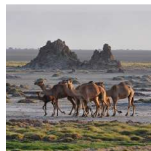
Encounters on Lake Abbé

Breakfast at the camp and TREKKING ON FOOT (14 km, approx. 5h00) to Lake Assal, accompanied by dromedaries and Afar porters. Lunch box on the way. Early afternoon arrival in Kalafa, where we will meet the 4x4s and continue on to LAKE ASSAL, the lowest point on the African continent, located at -155 metres below sea level. Situated at the western end of the Ghoubbet al-Kharab, Lake Assal is essentially made up of rainwater and a large quantity of water of marine origin, which manages to reach the lake thanks to the cracks joining it to the arm of the sea. Due to the very strong evaporation, the mixed waters instead of lowering their salinity increase it to values up to 10 times higher than the marine salinity. Evaporation causes the formation of whitish deposits of evaporites, mainly salt and gypsum, which cover a large expanse visible all around the lake. We will admire this turquoise-coloured lake bordered by large salt deposits, a mine used by the AFAR NOMADI who still today load sacks of salt onto their dromedaries before embarking on a long caravan journey to Ethiopia. Departure for the GULF OF GHoubbet (Ghoubbet el Kharab, the 'gulf of demons'), where we will be able to admire a Dantesque scenery, where the water of the bight is surrounded by ashen mountains and hides a series of submarine volcanoes, of which the 'devil's islands' are an emerging testimony. Accommodation at Campement Ghoubbet, in traditional huts with shared beds, showers and spartan bathrooms.