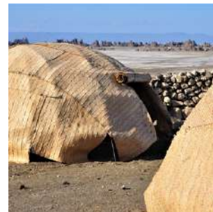
Reawakening at the Campement d'Asboley

Breakfast at the Campement and exploration of the surroundings of LAKE ABBE', a lunar landscape of steaming limestone chimneys, sulphur-smelling boiling water springs and groups of pink flamingos. Then on to Dikhil, lunch in a restaurant. We cross the GAGGADE plain to the village of Allouili, where we set up our tented camp. Dinner and overnight at the camp, in double igloo tents.