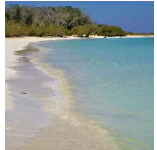
Beach on Moucha Island