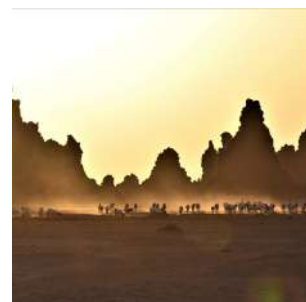
Sunset over the chimneys of Lake Abbé