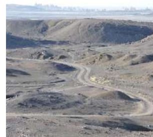
The 'moon on earth'

Breakfast at the hotel and departure westwards, crossing two large desert plains, the PETIT BARRA and the GRAND BARRA, an incredible expanse of white clay dried out by the sun, a place where it is easy to meet gazelles and... mirages. Lunch in a restaurant in Dikhil. Continue through the village of As Eyla to arrive at LAKE ABBÉ before sunset, to watch the sun go down behind the limestone chimneys. A characteristic endoreic lake, i.e. landlocked, fed mainly by the Auasc river from Ethiopia, it is home to one of the most beautiful and unusual geological spectacles: the calcium-rich waters, very hot because they are heated by the rocks in contact with the magma below, rise up from the numerous fractures meeting colder waters on the surface of the lake, causing the rapid deposition of limestone in the form of very porous travertine that accumulates in imposing chimneys up to tens of metres high. Accommodation at the Campement d'Asboley, in traditional huts with shared beds, showers and spartan bathrooms. Dinner and overnight stay.