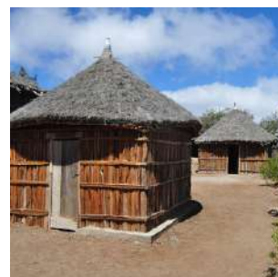
Campement du Day

After breakfast, departure to discover FORESTA DU DAY, a green spot at 1,500 metres above sea level offering incredible views of the Gulf of Tadjoura. In addition to its incredibly varied flora, this forest is famous for being the habitat of the Djibouti francolin, an endemic species, and for providing shelter to deer, monkeys and... leopards. Picnic lunch and on to Bankoualé through beautiful mountain scenery and nomadic encampments. Stop at the village of ARDO, where Afar women have created a handicraft cooperative where you can see the famous baskets being made. Arrival at the green oasis of BANKOUALE', walk to discover its surroundings, made up of enchanting gardens and fruit trees and waterways. Dinner and overnight stay at the Campement, in traditional huts with shared beds, showers and spartan bathrooms.