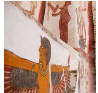
Paintings in Muzawaka