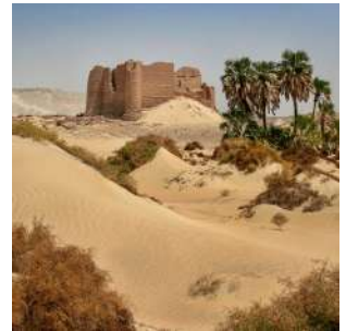
Along the Roman Limes

Early in the morning, after breakfast, we head to LABAKHA, a tiny oasis in the middle of an isolated desert landscape, which preserves the ruins of a four-storey-high Roman fortress, two temples and a vast necropolis. This site along the Limes, the southern border of the Empire, controlled the caravan flow out of Roman Egypt and westwards. If possible we will continue along a difficult sandy track to the site of UMM EL-DABADIB, where there are the remains of the fortress and the most complex underground aqueduct built by the Romans in this region. Return to Kharga, lunch in a restaurant. In the afternoon, visit of the ARCHAEOLOGICAL MUSEUM of Kharga, with valuable exhibits including sarcophagi from the Roman period, the IBIS TEMPLE, built during the Persian period under Emperor Darius and dedicated to the god Amun, and the NECROPOLIS OF BAGAWAT, one of the oldest and most important Christian necropolises in the world. Dating back to the 4th century and consisting of 263 mud-brick tombs and a large church, the site features well-preserved paintings depicting Old Testament passages, such as the Chapel of Peace and the Chapel of Exodus, which we will visit. Dinner and overnight at the hotel, in double rooms with services.