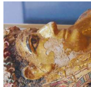
Museum of the Golden Mummies