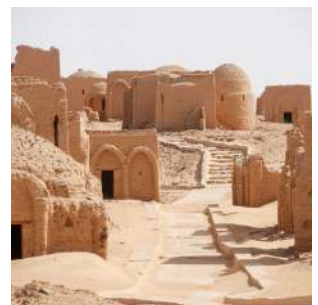
Christian Necropolis of Bagawat