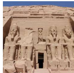
Temple of Ramses II

After breakfast disembark and visit the two famous sites of ABU SIMBEL, the Great Temple of Ramses II and the Small Temple of his wife Néfertari, saved from the waters with the help of UNESCO. Carved into the heart of the mountain, the temple of Ramses II dates back to the 13th century BC, and was built to commemorate the victory at the Battle of Qadesh, celebrating the glory of the deities Ptah, Ra-Harakhti and Amon-Ra. Its façade, made of pink sandstone, measures 30 metres in height and 40 metres in width, and features four colossal statues of Ramses II with the two crowns of Upper and Lower Egypt, as well as bas-reliefs and friezes. Not far away stands the smaller temple dedicated to the cult of the goddess Hathor, to whom the royal bride Néfertari was dedicated, depicted here with the attributes of the deity. Then transfer by car to Aswan, lunch box on the way. On arrival accommodation at Hotel Kato Dool or similar, a Nubian guesthouse placidly nestled on the banks of the Nile. Afternoon at leisure to relax or explore on foot the picturesque village of Gharb Sohail, with its ornate houses. Overnight stay in a double room with services.