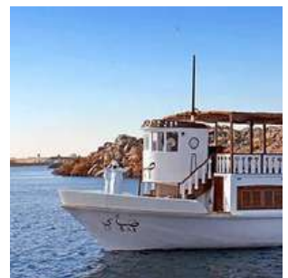
On board the dahabeya