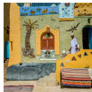
Village of Gharb Sohail