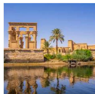
The Trajan's Kiosk and the Philae Temple

After breakfast, a day dedicated to visiting ASWAN. We will start with the PHILAE ISLAND, located near the dam, centred on the cult of Isis: the main temple from Ptolemaic times, the temple of Hathor erected under Ptolemy VI and enlarged in Roman times by Augustus, the elegant Trajan's Kiosk, called 'the pharaoh's bed' by the locals, the temple of Augustus and the monumental gate of Diocletian. This is followed by an excursion on the NILE in a FELUCA, the traditional sailing boat of Nubia, and a visit to the botanical garden on KIRCHNER ISLAND, a beautiful tropical paradise transformed into a garden in 1928. Lunch in a restaurant. In the afternoon, time at leisure to visit the Gharb Sohail market, where you can buy spices, karkadè and characteristic Nubian souvenirs. Overnight stay in a double room with private facilities.