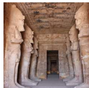
Inside the Temple of Ramses II