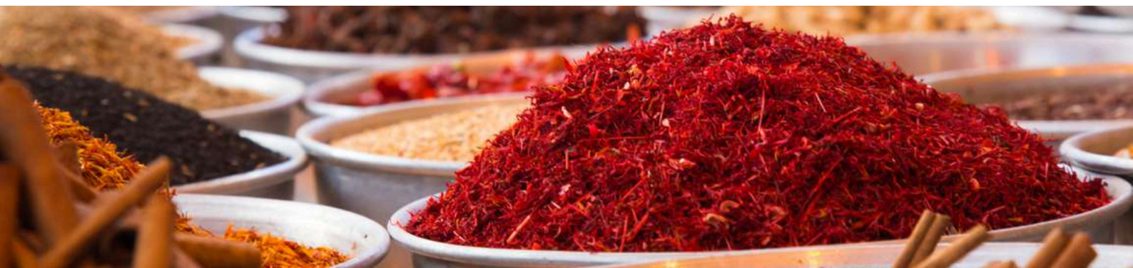
At the Aswan market

After breakfast transfer to the airport in time for your return flight or onwards to other destinations. End of services.