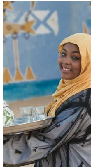
Welcome to Nubia!