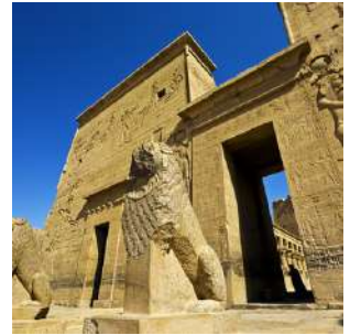
Portal of the Ptolemaic Temple