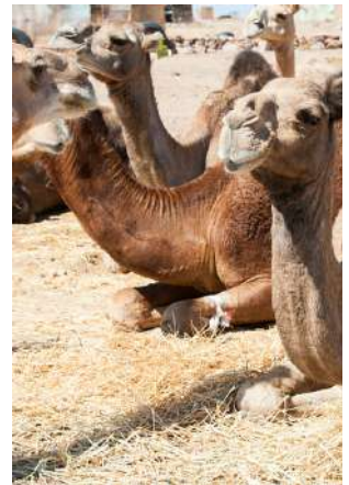
Daraw dromedary market