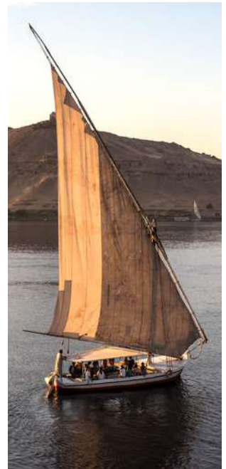
In a felucca on the Nile

Breakfast on board and disembarkation. Morning dedicated to visiting ASWAN, such as the Nubian Museum and the so-called unfinished obelisk, a gigantic monument whose construction was interrupted due to cracks in the granite. Lunch in a restaurant. Following this, we will cruise the Nile in a FELUCCA, the traditional sailing boat of Nubia, and visit the HELLPHANTINE ISLAND, with the temples of Khnoum and Satet, and the botanical garden on KIRCHNER ISLAND, a splendid tropical paradise transformed into a garden in 1928. We end the day with a visit to the souk in Aswan, where we can buy spices, karkadè and characteristic Nubian souvenirs. Accommodation at the Hotel Basma or similar and overnight stay in a double room with private facilities.