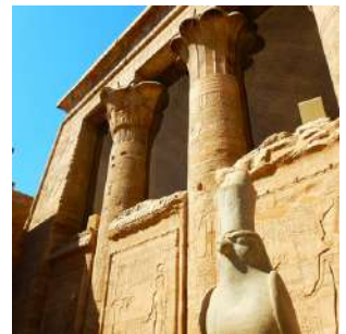
Temple and statue of Horus at Edfu

Breakfast on board. We will enjoy a morning swim before resuming our navigation towards BASAW, a place off the beaten track, which will allow us more direct contact with the local reality. We will observe the travel scenes of the pilgrimage to Mecca depicted on the facades of the village houses and here we will have the opportunity to discover the fishing that the locals practise on their small boats with traditional nets. Return on board and lunch. Navigation and landing at GEBEL SILSILA or the 'Mountain of the Chain' where the Nile squeezes between two rocky massifs and where the most important sandstone quarries were located, from which many of the building materials for the buildings of various Upper Egyptian localities were taken. Back on board and sailing along a narrower stretch of the Nile with increasingly wild scenery and steep cliffs. We will see the speos of HOREMHEB, a small rock sanctuary containing seven statues, and stelae and chapels erected by various pharaohs that served as places of veneration of the Nile during solemn festivals. Dinner and overnight on board.