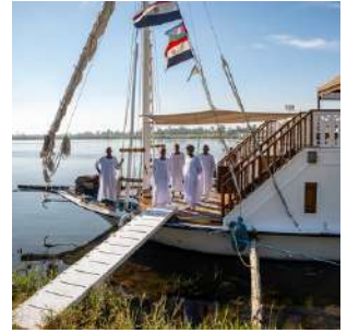
Embarking on the dahabeya