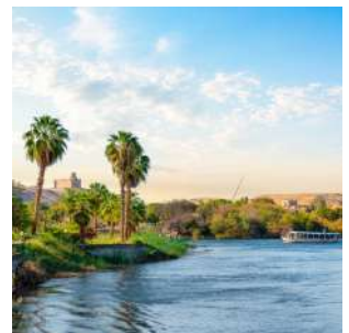
Along the banks of the Nile