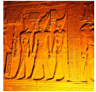
High Relief in the Temple of Kom Ombo

Breakfast on board and sail to KOM OMBO, with its extraordinary temple from the Ptolemaic period, which dominates the fields below from the top of the hill. A unique 'double' temple, built for the worship of the crocodile god Sobek and the healer god Horus Haoeris, with two entrances, a double row of parallel doors and two shrines separated by a dividing wall. On the walls of the majestic temple we will be able to observe scenes of offerings, an array of surgical instruments and even an Egyptian calendar. We will have the opportunity to see crocodile mummies in an exceptional state of preservation inside a small museum near the temple. We then visit one of the largest local markets, at DARAW, the dromedary trade capital of Egypt, which arrives from Sudan via the '40-day trail' through ancient Nubia. This is an ancient trade route between the north and south of the Kingdom that was travelled by caravans of dromedaries and through which all kinds of merchandise from the various regions of Africa were transported. Return to the ship and lunch. Navigation to reach the VILLAGE OF HERBIAB, where we can discover the methods of millenary agriculture dating back to Pharaonic times and have time to enjoy a last swim on the beach before setting off again in the direction of Aswan. Dinner on board and overnight stay.