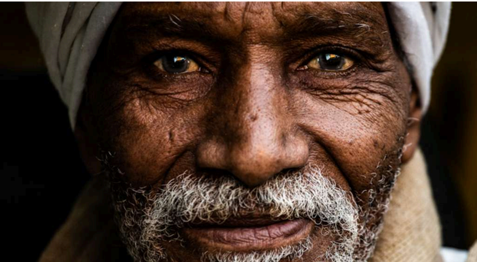
Encounters along the Nile