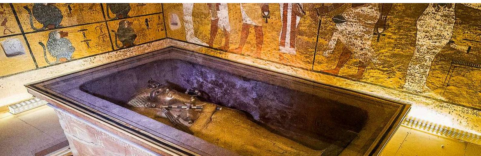
Tomb in the Valley of the Kings