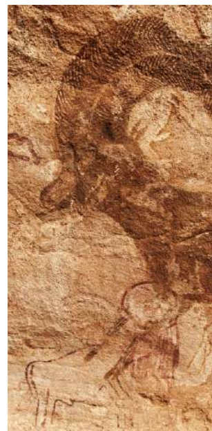
Mouflon in Tan Zoumaitak