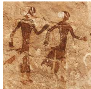
"African Women" in Tan Zoumaitak

Days are dedicated to the exploration on foot of the TASSILI N'AJJAR, an incredible open-air museum with more than 15,000 depictions, including rock paintings and graffiti. Arrival in TAMRIT, where we can admire the oldest cypress trees in the world, which have managed to survive thanks to the microclimate and bear witness to when the Sahara was a verdant region covered with rivers and forests. This beautiful area is characterised by rocky columns up to 20 metres high, with valuable paintings. We will admire TAN ZOUMAITAK, the first station to be discovered by Henry Lothe in 1956, where the largest number of paintings from the so-called 'Round Head' period (the 'African women' are famous) can be found. We continue to IN ITINEN, passing through a spectacular scenery of rocks sculpted by erosion, with a large concentration of wall art covering various prehistoric periods, including the depiction of a four-metre elephant and so-called 'justices of the peace'.