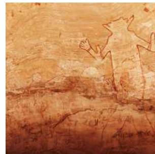
'God of Sefar'

Arrival in ALGIERS to coincide with your return flight. End of services.