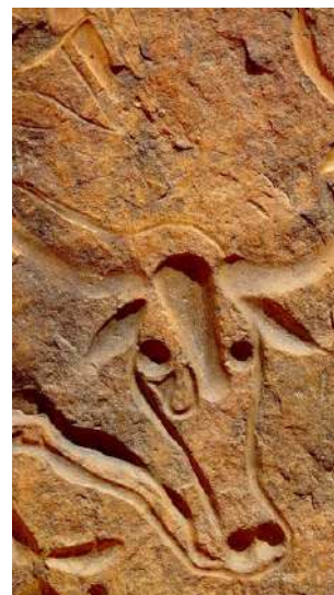
La Vache qui Pleure