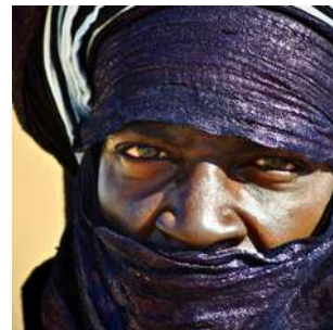
Welcome to the Algerian south!

Flight to Algiers, formalities upon arrival. Transfer to the national terminal for the Air Algerie flight towards Djanet (scheduled at 22h15). On arrival meeting with Kanaga Africa Tours staff and accommodation at the Grotte des Ambassadeurs hotel or similar, overnight in double room with services.