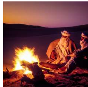
Dinner around the fire with the Tuaregs