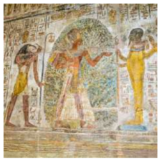
Tomb of Pennout