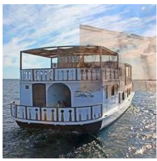
Navigation on Lake Nasser