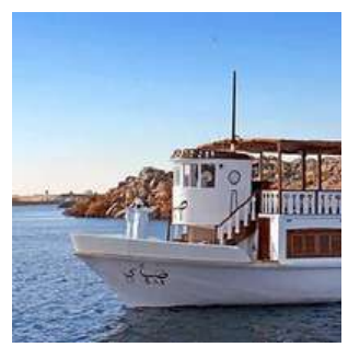
On board the dahabeya