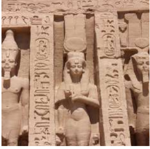
Temple of Nefertari