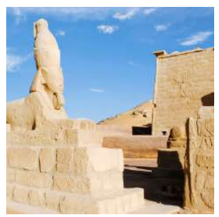
Sphinx at Wadi el Seboua