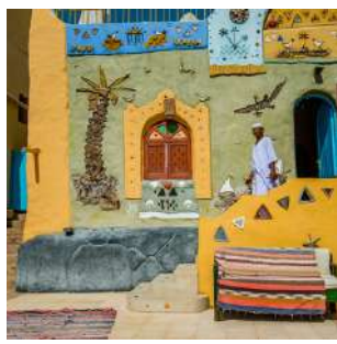
Village of Gharb Sohail