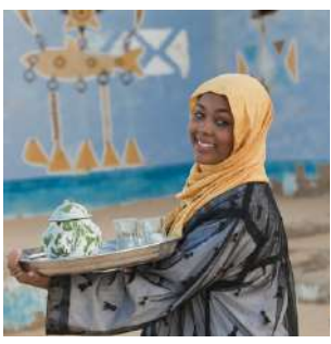
Welcome to Nubia!

Breakfast on board. Navigation to WADI EL SEBOUA, where we admire the temples saved by UNESCO. The temple of DAKKA, dedicated to the god Thot, was erected at the end of the 3rd century BC by the Meroitic king Arkhamani, a contemporary of the pharaoh Ptolemy IV, and later enriched with new decorations under other Ptolemaic rulers and extended by the Roman emperors Augustus and Tiberius. The temple of WADI EL SEBOUA, a semi-rural site commissioned by Ramses II, was dedicated to the god Amon-Ra and Ra-Harakhiti. It is entered through an impressive avenue adorned with sphinxes with the likeness of the deified ruler and the lion's body. Finally, we visit the adjacent site of MEHARRAQA, built at the behest of Augustus and dedicated to the syncretic deity Serapis (a fusion of Osiri, Arpis and Zeus) and the goddess Isis, consisting of a hypostyle hall and a colonnaded portico. Back on board for lunch. Short boat trip to WADI EL ARAB, an area of fine sand dunes where we will take a pleasant walk. Navigation in the direction of Amada, during which we will be able to admire the fishermen's dwellings and the verdant shores of the lake where, with a little luck, we may spot Nile crocodiles. Dinner and overnight on board.