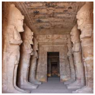
Inside the Temple of Ramses II

After breakfast transfer to the airport in time for your return flight or onwards to other destinations. End of services.