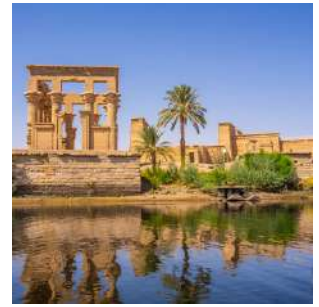
Philae Temple on Aglikia Island

Breakfast on board and navigation, lunch on board. We will leave by vehicle to reach the pier where we will embark to the island of Aglikia, where the temple complex of PHILAE has been relocated. Visit to the site dedicated to the goddess Isis, with its temple from the Ptolemaic period of rare beauty, the temple of Hathor, erected under Ptolemy VI and enlarged in Roman times by Augustus, the elegant kiosk of Trajan, the temple of Augustus and the monumental gate of Diocletian. After the visit we can enjoy a wonderful sunset with a view of the temples. Back on board, dinner and overnight stay.