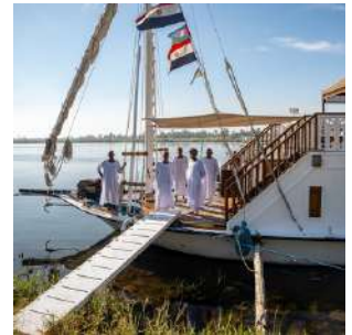
Embarking on the dahabeya