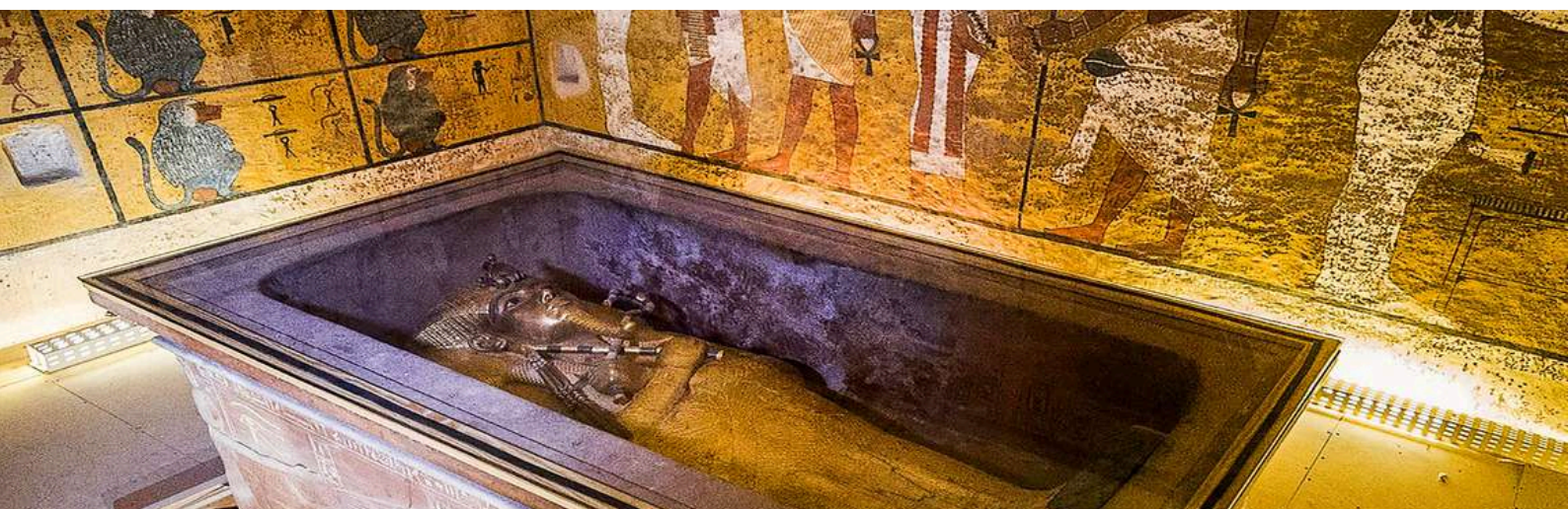
Tomb in the Valley of the Kings