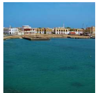
The ancient port of Massawa