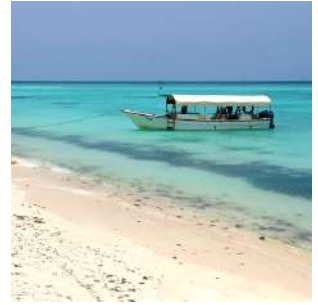
White beach in Dahlak island

Breakfast at the camp and morning dedicated to walking on the beach and/or snorkelling in the colourful coral reef. Lunch and return to the mainland, continuing to Asmara where day use rooms await us. In the late afternoon, we complete our visit to 'little Rome' by going to the market, where we can find souvenirs such as jebena (coffee jugs), straw baskets, leather goods, and to the small coffee roasters, where we can buy the fine local coffee. Transfer to the airport in time for your return flight, end of services.