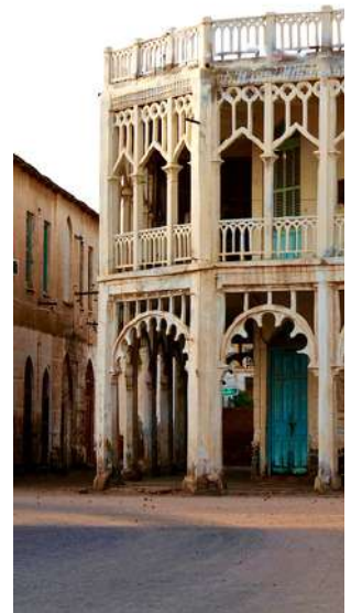
Along the streets of Massawa

Breakfast at the hotel and departure for the two-day excursion aboard a speedboat to the DAHLAK ISLANDS, an archipelago of over 200 islands in the heart of the Red Sea, an unspoilt natural paradise characterised by beautiful deserted beaches surrounded by calm turquoise waters that are pleasantly warm all year round, ideal for snorkelling and diving to discover the coral reef and its colourful tropical fish. It's an exceptional ecosystem that satisfies the interest of sea lovers and bird enthusiasts, as these islands are home to colonies of migratory birds that stop here to feed and rest. We will visit a couple of islands* with different characteristics and attractions, such as the coral sandbank entirely surrounded by the Madote reef and the volcanic island of Dissei, the extreme offshoot of the Dancalia region which, with a series of reliefs and inlets that make mooring easy, is one of the few inhabited islands in the archipelago. There lives a small community of Afar fishermen, whose women welcome us by setting up an improvised bazaar of bracelets and shell necklaces on the beach. On none of the islands are there any fixed facilities, so having the privilege of appreciating this pristine nature will require a good spirit of adaptation, with nights in igloo tents and camp toilets (small chemical toilet and fresh water for rationed showers). Lunch and dinner at the camp prepared by our cook, overnight stay in a double tent under millions of stars.