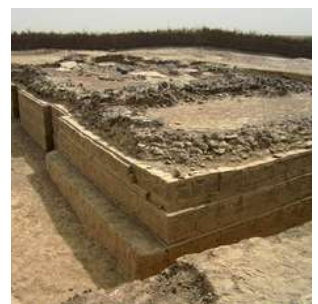
Excavations in Adulis