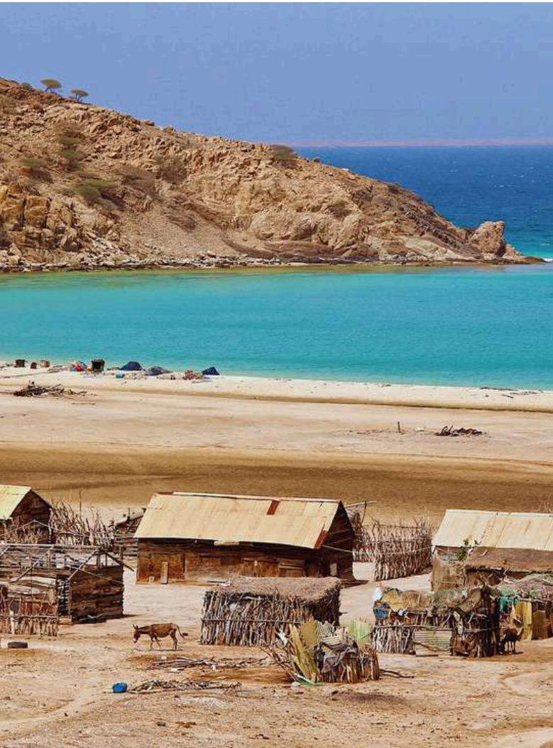
Afar fishing village