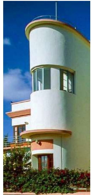
Italian Artdeco villa

To begin with, we will head to the Medebar, the old Caravanserai, now transformed into a bustling recycling market, where old sheet metal and rusty antiques are given new life. And while the men disassemble, bend, assemble and weld in a concert of metallic notes and puffs of steam, we will also observe the work of the women, intent on grinding chilli peppers for the preparation of berberé, the characteristic spice that distinguishes the tasty Eritrean cuisine. Afterwards we will visit the Orthodox Cathedral of Enda Mariam, where generally on Saturdays young married couples go to celebrate their union, wearing the traditional clothes of the Tigrini, the majority ethnic group in Eritrea.