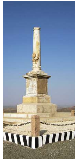
Memorial to the fallen of Dogali