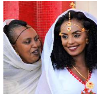
Welcome to Eritrea!

Flight to Asmara. Arrive late in the evening, meet with Kanaga Africa Tours staff who will arrange transfer to the Crystal Hotel or similar. Overnight stay in a double room with bathroom.