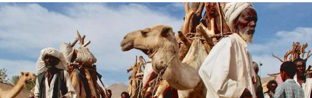
At the Keren market

Breakfast at the hotel and departure for the capital. We continue towards the coast, following a spectacular road built by the Italians in 1935-36, which in 115 km covers a difference in altitude of 2,300 metres, including daring ups and downs and scenic viewpoints where the gaze sweeps from steep rocky slopes to gentle slopes and wide valleys sloping down to the fiery plains of the Red Sea. On the way, we will stop for a lunch box (sandwiches and fruit) at a 'belvedere' where one of the Italian army's control stations once stood.