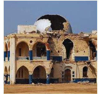
Ruins of the Turkish Imperial Palace