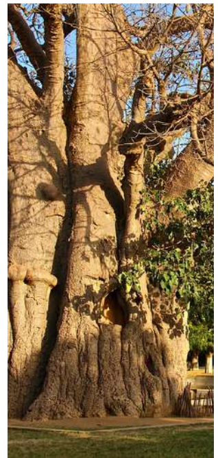
Madonna of the Baobab