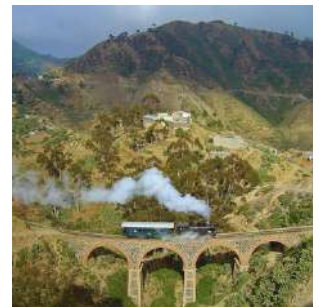
The railway in the landscapes of the plateau