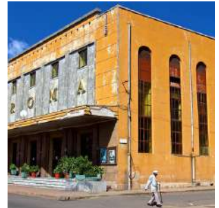
Architecture of Asmara

Breakfast at the hotel and a day dedicated to visiting ASMARA, the 'little Rome', declared a UNESCO World Heritage Site in 2017 thanks to the extraordinary mixture of architectural styles that embellish its urban fabric, harmoniously combining 20th-century avant-garde and daring construction techniques of Italian rationalist urbanism, reinterpreted in a local key.