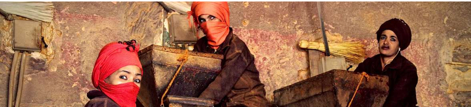
Berberé processing at the Medebar

We arrive at Harnet Avenue (formerly 'Corso Italia'), the main artery of the city, along which are concentrated the most interesting examples of Italian Art Deco and Futurist architecture. From an artistic and constructive point of view, Asmara encompasses all the styles of the early 20th century: Cubism, Futurism, Neoclassicism, Rationalism and Expressionism, declined in a pleasant alternation of public and private buildings, which recall the memory of a past that seems to have crystallised in the 1930s.