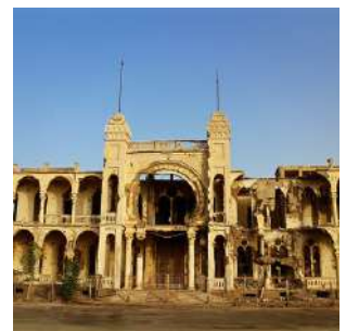
The Bank of Italy