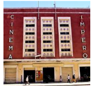
The iconic Empire Cinema in Asmara

*The train excursion is subject to reconfirmation on site, with a minimum of 20 persons for Sunday departure.