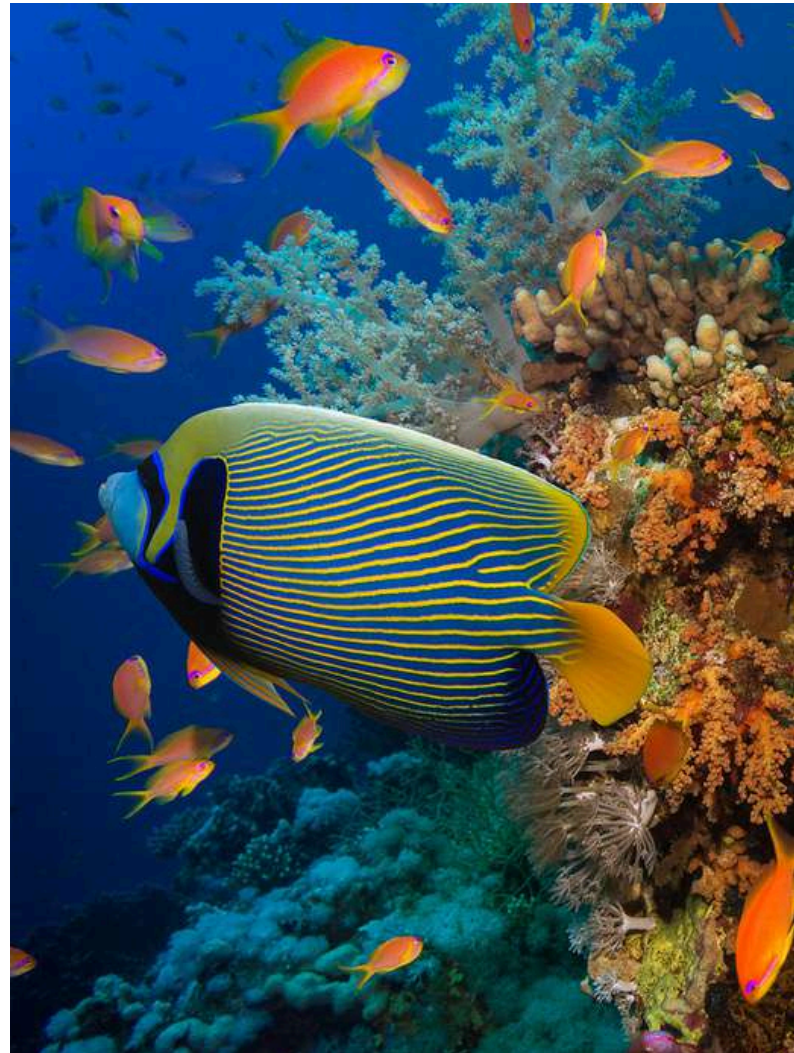
Beautifully coloured backdrops