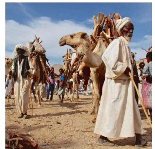
At the Keren market