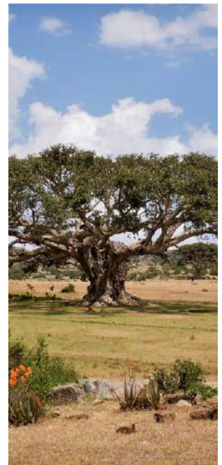
A ficus sycomorus