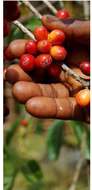
The famous Ethiopian coffee

Breakfast and departure north, with stops for lunch in a restaurant in Sodo and coffee in a traditional Alaba family, where it is usually taken by adding salt and not sugar. Afternoon arrival at LAKE LANGANO and accommodation at the Sabana Beach Resort or similar, time at leisure at the lake. Overnight stay in a double room with services.