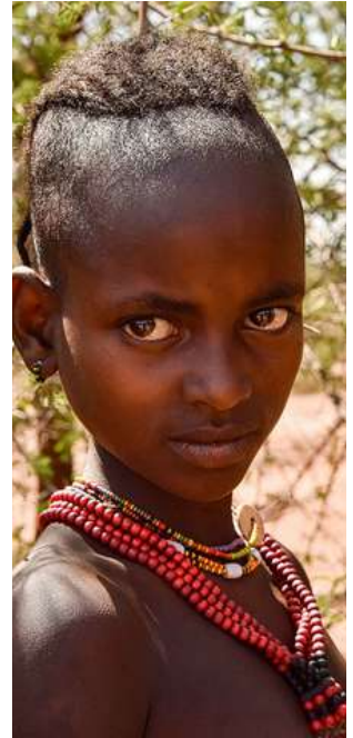
Banna Girl in Key Afer

After breakfast, visit the ethnographic museum in Jinka, where we will find everyday objects from the various ethnic groups of the lower Omo valley. Afterwards, depart for the picturesque KEY AFER weekly MARKET, where Banna, Tsemay and Ari people flock to the town, mainly to exchange livestock. Lunch in a local restaurant or lunch box. Continuation and participation in the KONSOWEEKLY MARKET, characteristic for the embroidered fabrics used by the women of this ethnic group for their skirts, and a visit to the KONSOWILLAGES, declared a UNESCO World Heritage site, characteristic for their terraces with mixed crops, the stone walls that enclose them forming veritable labyrinths, the generation posts and for the wagas, carved wooden sculptures in honour of deceased warriors, pillars of the ancestor cult practised by this population (visible almost exclusively in the museum). Accommodation at Kanta Lodge or similar and overnight stay in a double room with services.