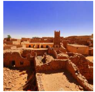
The Chinguetti Mosque

Breakfast at the Auberge and departure in the direction of Chinguetti, penetrating the mountainous reliefs of the Adrar (adrar, from the Berber word for "mountain") as far as the AMOGJAR Pass, where we will be able to see the SAGANNE FORT, used for the filming of a famous film on colonisation, and the AGROUR ROCK PAINTINGS. These original paintings, eroded by time and wind, show us how millions of years ago these now arid lands were a lush savannah inhabited by elephants, antelopes, lions, giraffes, ... Picnic lunch. Arrival at the ancient caravan city of CHINGUETTI, the seventh holy city of Islam declared a UNESCO World Heritage Site. We will wander through the citadel's alleyways, discovering its famous stone mosque (exterior) and libraries containing ancient manuscripts. Then departure for the majestic dunes of the ERG OUARANE at the entrance to the city (in 4x4 or on a camel) to admire the sunset. Accommodation at the Auberge des caravanes or similar, dinner and overnight in a double room with services.