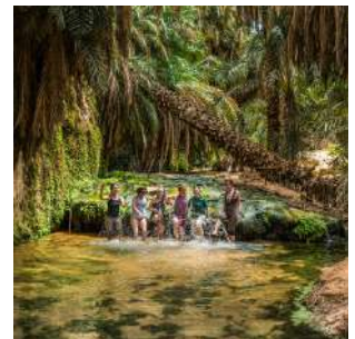
In the oasis of Terjit

After breakfast, we depart along the track to MHAIJRAT, a fishing village, where we meet the Imraguen women dedicated to drying fish and producing roe. We continue on to magnificent dunes jutting into the ocean, where we set up our tented camp. Picnic lunch en route. In the afternoon, time at leisure for a refreshing swim or a walk along the coast. Dinner at the camp prepared by our cook and overnight stay in a traditional Mauritanian tent (khaima) or igloo tent.