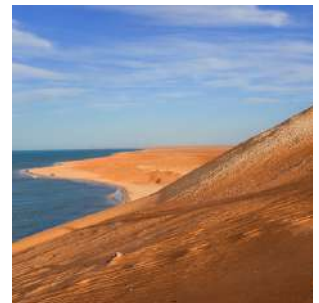
Between the desert and the ocean

After breakfast we will head along the ATLANTIC COAST, following the rhythms of the tides, to NOUAMGHAR, inside the BANC D'ARGUIN park, to admire the colony of pink flamingos and other migratory species that often inhabit the lagoon. Return along an asphalt road in the direction of the capital. Lunch at Les Sultanes Chez Nico or similar restaurant by the sea, where we can enjoy fresh fish. This was followed by a visit to the most significant places in NOUAKCHOTT, the craft shops and the port de peche, the bustling fish market. Day use rooms on request. Transfer to the airport, end of services.