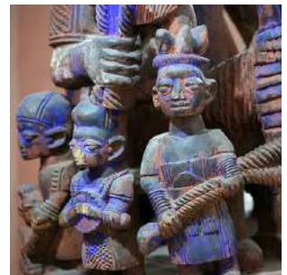
At the Lagos Museum