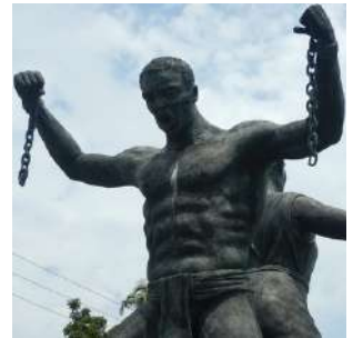
Monument in Badagry