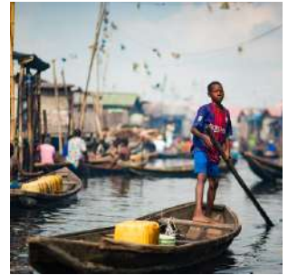
In the Makoko slum