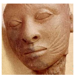
Terracotta in the Ife Museum

Breakfast at the hotel and transfer to INISA, where we will attend a TWINS CEREMONY, who play a special role in Yoruba society. Return to Oshogbo and visit the Nike art gallery, an art gallery where the works of Nigerian artists are exhibited and where we will be able to attend a workshop on the batik technique. Lunch in a restaurant. Afterwards we will watch the dance of the GELEDE MASKS. Transfer to Ibadan, a modern city that has flourished around the cocoa business. Accommodation at the Golden Tulip Hotel or similar and overnight stay in double rooms with services.