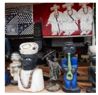
Inside the Alaka Palace