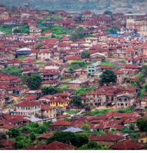
View of Abeokuta

Breakfast at the hotel and, before leaving Abeokuta, we will witness a release of the EGUNUKO spirits, protective masks of the town up to 3 metres high. Afterwards, transfer to ILE-IFE, a town that stands on the ashes of the ancient Kingdom of Ifé, amidst coastal plains and tropical forests, mangrove tunnels and river estuaries, plateaus and granite rocky hills that dot the fertile valleys of the interior. Here the evolved agricultural civilisation of the Yoruba developed in the 10th century, governed politically by the leadership of the Oba chief-clans, still active today, as well as by a colourful and mystical universe of voodoo divinities, so characteristic that one speaks of a true Yoruba religion, whose echoes reached and settled even in the Americas, through the forced deportations of the slave trade. Lunch in a restaurant. In the afternoon we visit the small and interesting museum, which houses some 'Ife heads' from around 1,000 years ago, the Oba royal palace, the mysterious Opa Oranmiyan stele, and the Oduduwa templealtar. Accommodation at Hotel Kris Court or similar and overnight in double rooms with services.