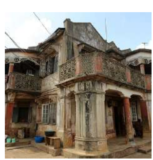
Architecture in ljebu Ode