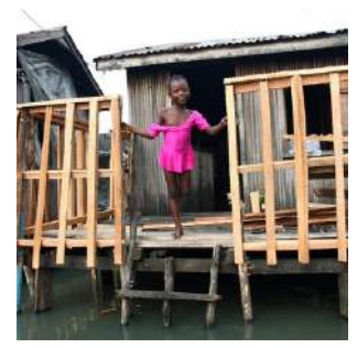
House on stilts in Makoko