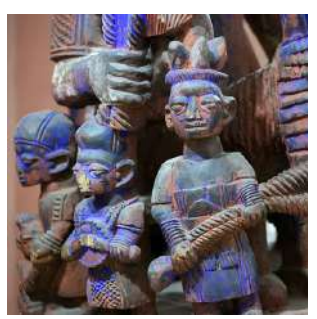
At the Lagos Museum