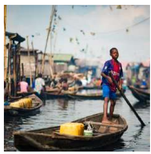
In the Makoko slum