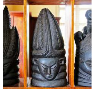
At the museum