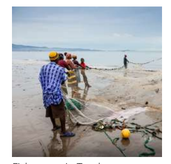
Fishermen in Tombo