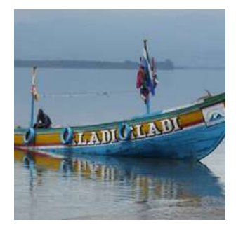
Gladi Gladi boat