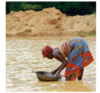
Sifting in the river