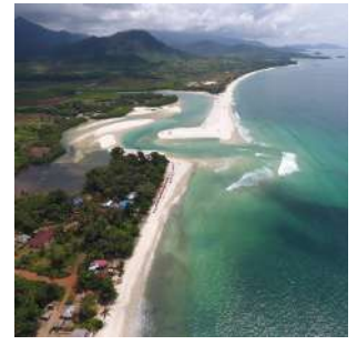
River n°2 Beach

Lodge*, located in the forest, dinner and overnight in a double bungalow with services. *Accommodations at Tacugama are limited, in case they are not available you will stay in a hotel in Freetown and the following morning you will visit the chimpanzee sanctuary.