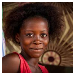
Welcome to Sierra Leone!

After breakfast departure for FREETOWN, the capital of Sierra Leone, with a ferry crossing of the river, where the bridge turns into a real 'market floating market". Once disembarked, we will take part on a city tour whose route will wind its way through busy city streets teeming with people engaged in a variety of activities, and more where we can appreciate the colonial architecture of some public buildings such as the Court of Justice, and those of Krio imprint, such as St John's Maroon Church, a Methodist church built in 1820 by the first slaves who returned from Jamaica. Near the Cotton Tree, the majestic symbolic tree of the city, we visit the National Museum with its interesting collection of masks, drums and artefacts pertaining to the various ethnic groups of the region, and finally the handicraft market, where we can find valuable masks, jewellery and ancient coins.