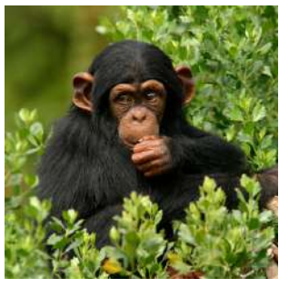
Tacugama Chimp Sanctuary

Early in the morning, after breakfast, depart for the BORDER WITH LIBERIA. Transfer day, lunch box. Clearance of customs formalities and arrival in the late afternoon in Robertsport, a coastal town on the Atlantic Atlantic, considered a paradise for those who love ride the ocean waves on surfboards. Accommodation at Nana's Lodge or similar, located on the beach. Free dinner and overnight stay in a double bungalow with services.