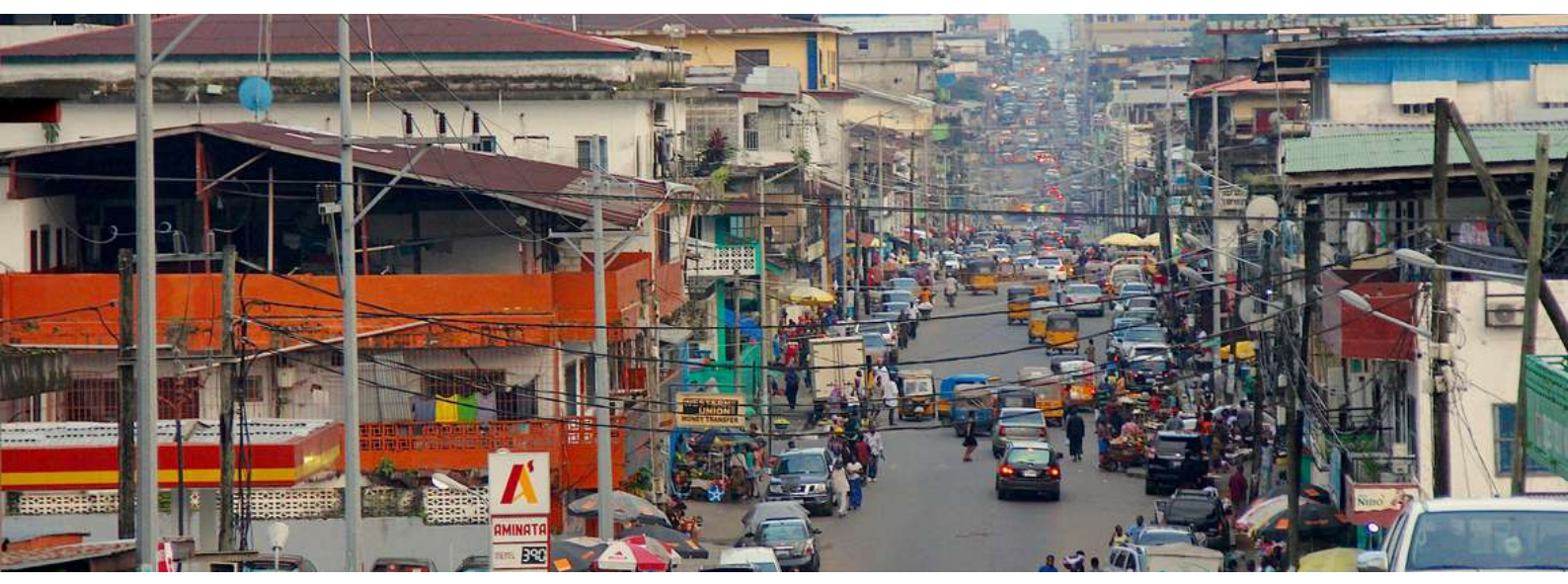
Traffic in Monrovia