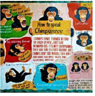
How to speak Chimpanzee

Early morning transfer to Robertsfield, where Monrovia Airport is located (a good 60 km from the city). End of services.