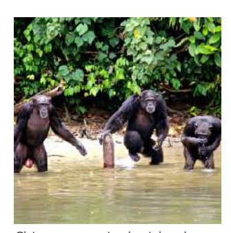
Chimpanzees in the islands