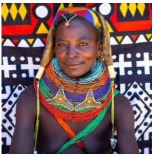
Welcome to Angola!

Breakfast at the hotel and a day dedicated to discovering one of Angola's most iconic and decorated tribes, the MUILA (also known as Huila or Mumuhuila). We visit the community of Kamuviu, where we meet the 'Muila of the plains': we greet the Soba (local chief) and his many wives. Mainly farmers, the older generations continue to worship the bull god, although cattle breeding is no longer a key element in their economy. Continuation to the small colonial town of CHIBIA, formerly Joao d'Almeida. Lunch in a restaurant and short walk to the neo-Baroque style church. From Chibia we head to the Mukuma area to meet the more conservative 'mountain Muila'. Stroll through the market where we will meet fully decorated women intent on bargaining for traditional wooden tribal dolls and nyianeka textiles. Return to Lubango and overnight at the hotel.