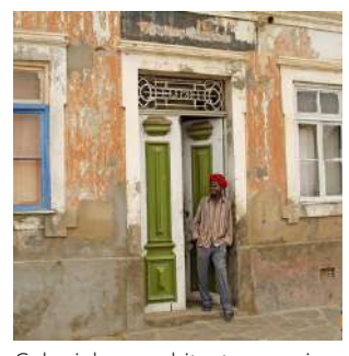
Colonial architecture i