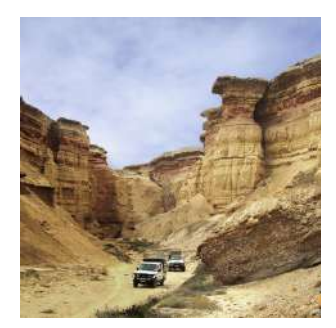
Canyon of Curoca