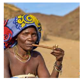
Cubal woman with characteristic ompota