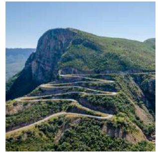
Serra de Leba

Breakfast at the hotel and departure towards the south where we will admire the abandoned church of Diogo Cao and the magnificent view of the ocean and the fishing village below. Afterwards, we enter the IONA PARK, where we will make an first stop to admire the wreck Vanessa. Proceeding along the shoreline, if the tide allows, we can admire the majestic dunes of the Iona desert which plunge into the Atlantic Ocean, creating a veritable wall of sand. The streaks of ochre sand and the yellow of the sand are reminiscent of a tiger's coat, hence the exotic name of the area, known as BAIA DOS TIGRES. Picnic lunch and on to TOMBWA, a town dedicated to fishing that preserves some interesting colonial buildings colonial buildings. Return at the end of the afternoon to Namibe and overnight at the hotel.