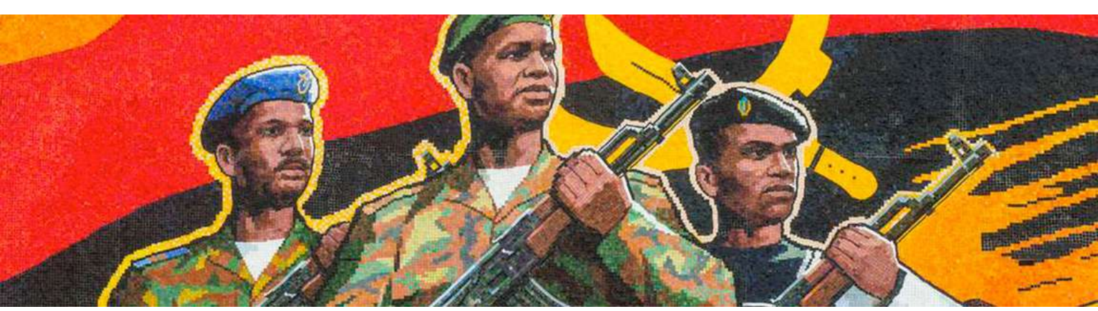
Murals in the streets of the capital