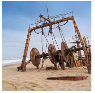
Wreck along the beach