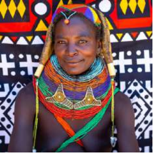
Welcome to Angola!

Breakfast at the hotel and a day dedicated to discovering one of Angola's most iconic and decorated tribes, the MUILA (also known as Huila or Mumuhuila). We visit the community of Kamuviu, where we meet the 'Muila of the plains': we greet the Soba (local chief) and his many wives. Mainly farmers, the older generations continue to worship the bull god, although cattle breeding is no longer a key element in their economy. Continuation to the small colonial town of CHIBIA, formerly Joao d'Almeida. Lunch in a restaurant and short walk to the neo-Baroque style church. From Chibia we head to the Mukuma area to meet the more conservative 'mountain Muila'. Stroll through the market where we will meet fully decorated women intent on bargaining for traditional wooden tribal dolls and nyianeka textiles. Return to Lubango and overnight at the hotel.