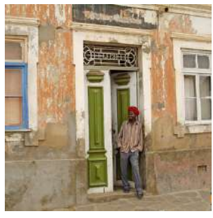
Colonial architecture in