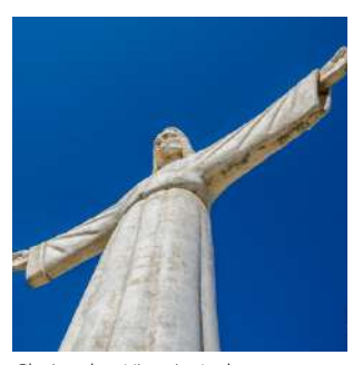
Christ the King in Lubango