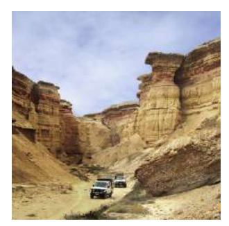
Canyon of Curoca