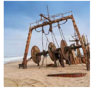
Wreck along the beach