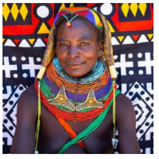
Welcome to Angola!

Breakfast at the hotel and a day dedicated to discovering one of Angola's most iconic and decorated tribes, the MUILA (also known as Huila or Mumuhuila). We visit the community of Kamuviu, where we meet the 'Muila of the plains': we greet the Soba (local chief) and his many wives. Mainly farmers, the older generations continue to worship the bull god, although cattle breeding is no longer a key element in their economy. Continuation to the small colonial town of CHIBIA, formerly Joao d'Almeida. Lunch in a restaurant and short walk to the neo-Baroque style church. From Chibia we head to the Mukuma area to meet the more conservative 'mountain Muila'. Stroll through the market where we will meet fully decorated women intent on bargaining for traditional wooden tribal dolls and nyianeka textiles. Return to Lubango and overnight at the hotel.