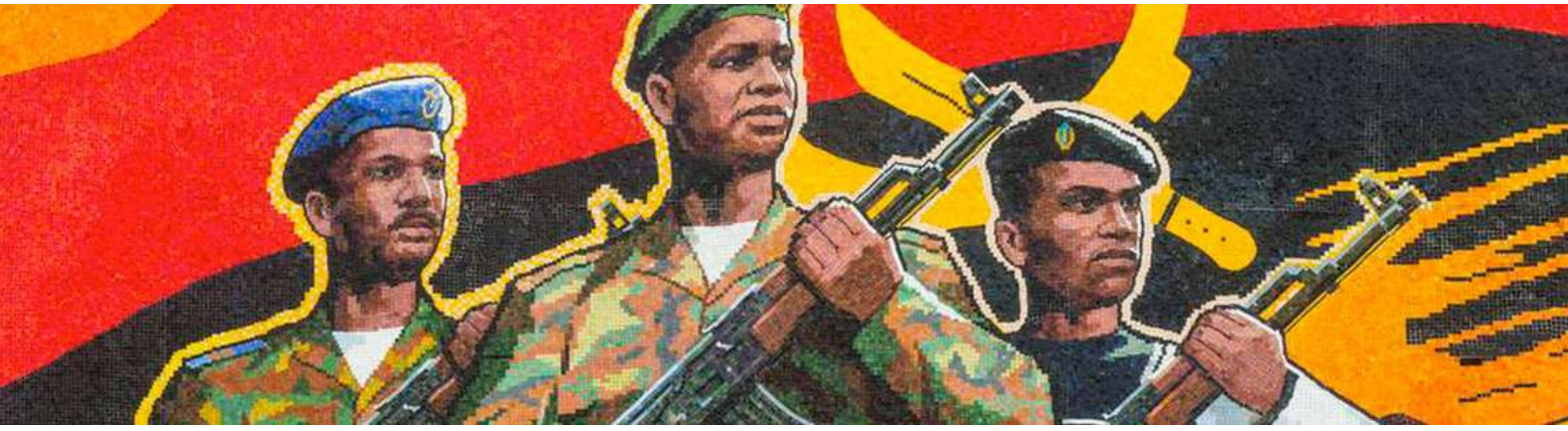
Murals in the streets of the capital