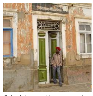
Colonial architecture ii