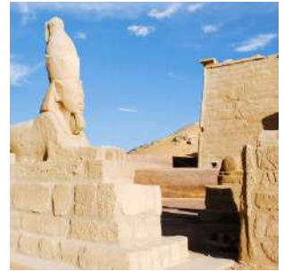
Sphinx at Wadi el Seboua