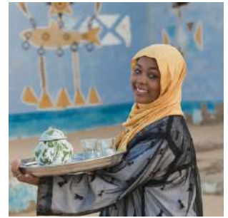
Welcome to Nubia!

After breakfast at the hotel, we board a 6-cabin dahabeya for a 4-day cruise on Lake Nasser. We will begin our discovery of the numerous archaeological sites rescued from the waters of the Nile by the most colossal preservation campaign under the aegis of UNESCO, following the construction of the Great Aswan Dam, which threatened to submerge them forever. In 1961, work began, in a race against time, to dismantle and reassemble the monuments, in raised or set back areas, progressively wrested away from the advancing water level. We head to KALABSHA, known for its imposing temple, the largest non-rock temple in Nubia, dedicated to the god Mandouli and dating back to the 1st century AD under the Roman Emperor Augustus, and then on to BEIT EL WALI, or the 'house of the saint', a partially rocky site dedicated to Amon-Ra, commissioned by Ramses II, including a sanctuary with beautiful bas-reliefs and a vestibule. Back on board for lunch. In the afternoon we sail on the calm waters of the lake to KHOUR EL GHAZAL, where we spend the night on board moored in a quiet cove. Dinner on board and overnight stay in a double cabin.