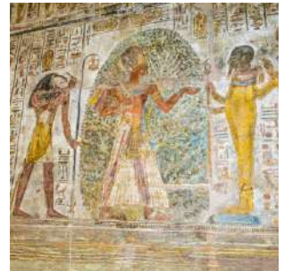
Tomb of Pennout

Breakfast on board followed by a visit to KASR IBRIM, the 'Fortress of Ibrim', which holds the architectural remains of a 7th century Christian-Coptic cathedral, albeit layered over earlier remains from the time of Amenhotep I, and which during the Ottoman rule was transformed into a fortress by Sultan Selim I in 1528. This site, much deteriorated due to the looting it has suffered, is the only one in the region that is on its original site and that the waters have not submerged, but rather turned into an island. Back on board for lunch. The afternoon is dedicated to sailing in the Masmara region, where several Nubian villages, now entirely submerged, once stood. As we approach ABU SIMBEL we slowly discover its two temples appearing from the waters of the lake, like an extremely moving mystical vision. Dinner and a chance to watch a sound and light show in front of the temple. Overnight stay on board.