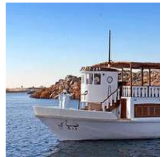
On board the dahabeya