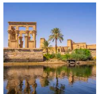
The Trajan's Kiosk and the Philae Temple

After breakfast, a day dedicated to visiting ASWAN. We will start with the PHILAE ISLAND, located near the dam, centred on the cult of Isis: the main temple from Ptolemaic times, the temple of Hathor erected under Ptolemy VI and enlarged in Roman times by Augustus, the elegant Trajan's Kiosk, called 'the pharaoh's bed' by the locals, the temple of Augustus and the monumental gate of Diocletian. This is followed by an excursion on the NILE in a FELUCA, the traditional sailing boat of Nubia, and a visit to the botanical garden on KIRCHNER ISLAND, a beautiful tropical paradise transformed into a garden in 1928. Lunch in a restaurant. In the afternoon, time at leisure to visit the Gharb Sohail market, where you can buy spices, karkadè and characteristic Nubian souvenirs. Overnight stay in a double room with private facilities.