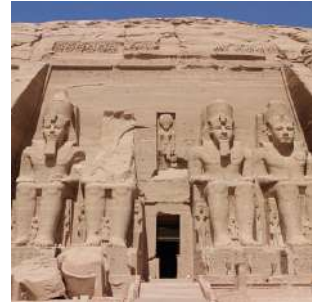
Temple of Ramses II

After breakfast disembark and visit the two famous sites of ABU SIMBEL, the Great Temple of Ramses II and the Small Temple of his wife Néfertari, saved from the waters with the help of UNESCO. Carved into the heart of the mountain, the temple of Ramses II dates back to the 13th century BC, and was built to commemorate the victory at the Battle of Qadesh, celebrating the glory of the deities Ptah, Ra-Harakhti and Amon-Ra. Its façade, made of pink sandstone, measures 30 metres in height and 40 metres in width, and features four colossal statues of Ramses II with the two crowns of Upper and Lower Egypt, as well as bas-reliefs and friezes. Not far away stands the smaller temple dedicated to the cult of the goddess Hathor, to whom the royal bride Néfertari was dedicated, depicted here with the attributes of the deity. Then transfer by car to Aswan, lunch box on the way. On arrival accommodation at Hotel Kato Dool or similar, a Nubian guesthouse placidly nestled on the banks of the Nile. Afternoon at leisure to relax or explore on foot the picturesque village of Gharb Sohail, with its ornate houses. Overnight stay in a double room with services.