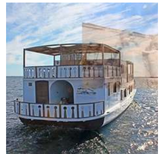
Navigation on Lake Nasser