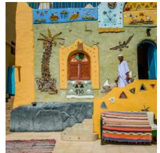
Village of Gharb Sohail