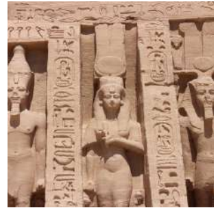
Temple of Nefertari