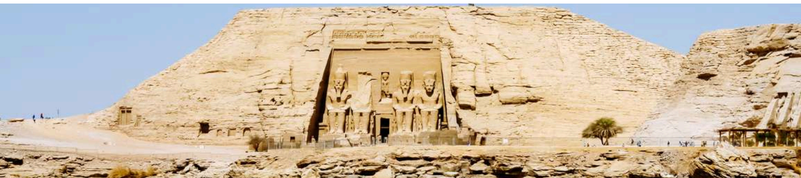
The temple of Abu Simbel seen from the lake