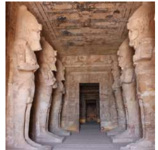
Inside the Temple of Ramses II