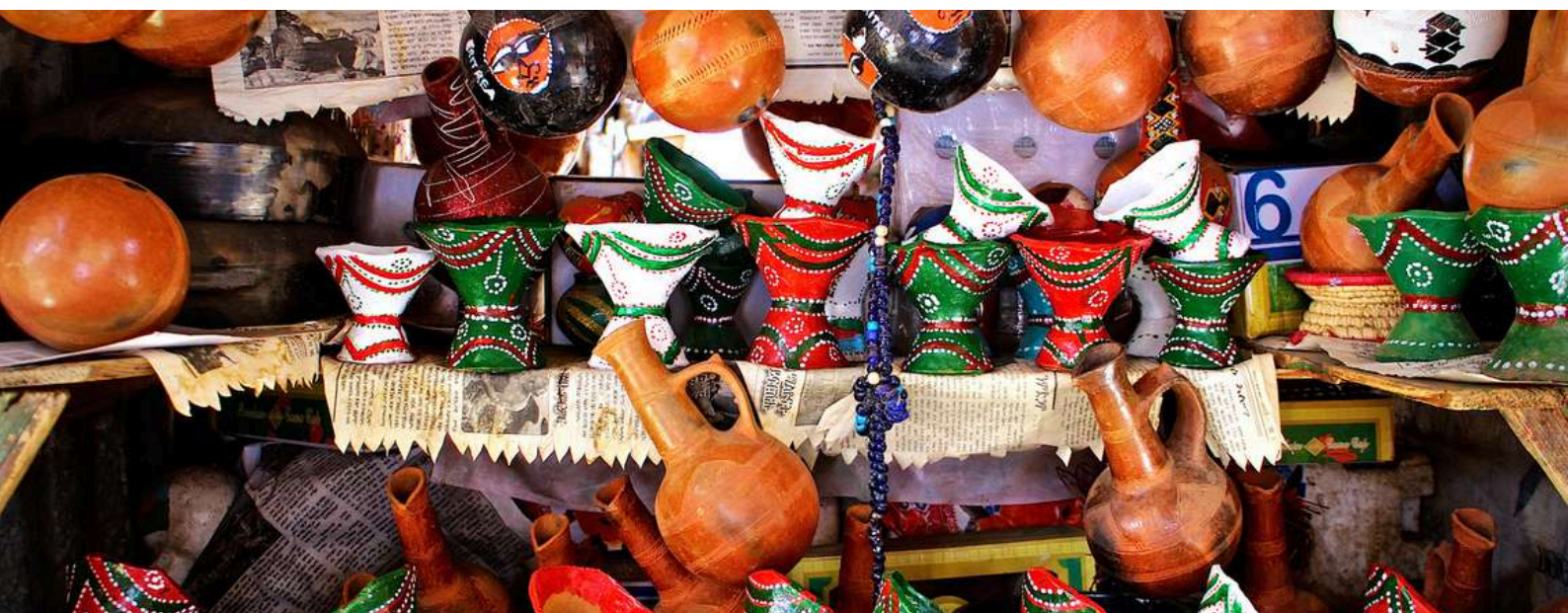
At the market in Asmara