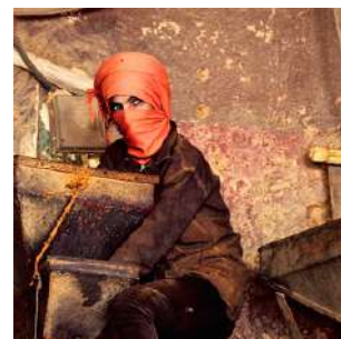
Berberé processing at the Medebar