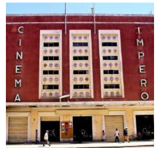
The Empire Cinema in Asmara

Accommodation at the Dahlak Hotel or similar and overnight in double rooms with services.