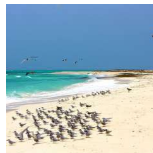
White Madote Beach

Breakfast at the camp and return to the mainland at MASSAWA. Accommodation at Dahlak Hotel or similar. In the afternoon we visit the ruins of the Imperial Palace built by the Turks in the 16th century, and later the summer residence of Haile Selassie. We will stroll through the alleyways of the old city, half destroyed by a violent earthquake in 1921 and rebuilt in record time by Italian architects who respected the original style of the collapsed buildings.