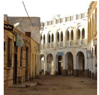
In the streets of Massawa