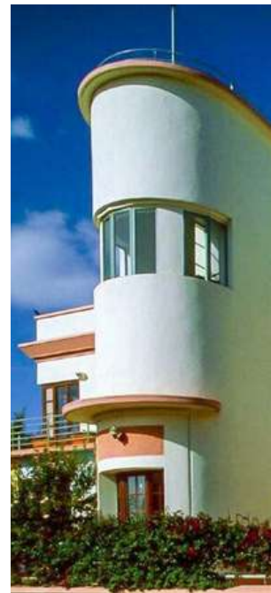
Italian Artdeco villa