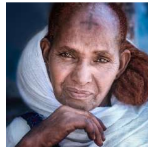
Welcome to Eritrea!

We visit the renowned Cinema Impero, which has not undergone any structural changes in 80 years and still entertains Asmaris with occasional film screenings and sporting events.