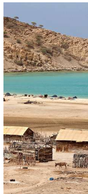
Afar fishing village