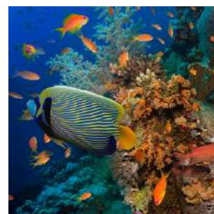
Beautifully coloured backdrops