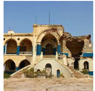
Turkish Imperial Palace

We will walk through the maze of narrow streets of its ancient heart, the arcades and the former Via Roma, which penetrates as far as the old covered bazaar, with the merchants' houses with their lopsided wooden terraces and the elegant mashrabiyya, Moorish-style balconies whose arabesque inlays provide shade and ventilation to the most elegant buildings. We finally arrive at the Hotel Savoia and the impressive ruined Bank of Italy building dating back to 1920, perhaps the structure that has paid the price most of all for the ferocity of the armed conflict. Overnight stay in a hotel.