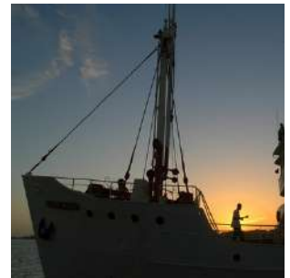
Bou el Mogdad