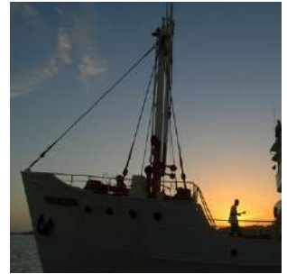
Bou el Mogdad