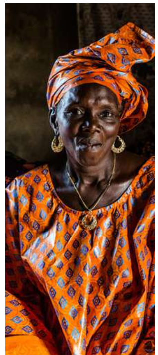
Goodbye in West Africa!!!!