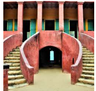
Maison des Esclaves

After breakfast, departure in the direction of Dakar. We will pass through the chaotic city, appreciating its architecture and some of its squares and monuments, such as the colonial station from where the famous Dakar-Bamako train still departs, to the pier where we will take the ferry to the GOREE ISLAND, a UNESCO World Heritage site. Here, amidst narrow streets, pretty, brightly coloured houses, climbing bougainvillea and handicraft boutiques, we admire Maisonla del Esclaves, a colonial house from 1776 where slaves were imprisoned before passing 'the gate of no return' and taking the route to the Americas, and the ramparts from where you can admire the entire island. Lunch in a restaurant. Return to the mainland in DAKAR, where we visit the craft market and have free time for shopping. Room in day use on request. Free dinner and transfer to the airport, end of services.