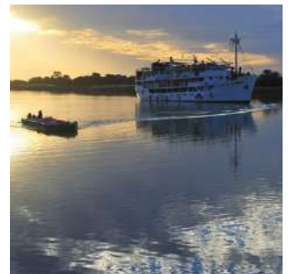
Bou El Mogdad