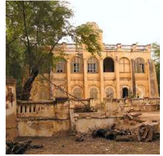
Folie du Baron Roger

After breakfast, visit the Folie du Baron Roger , an incredible French-style palace surrounded by earthen buildings, the traditional architecture of the region. Navigation to the mango forest bordering the village of Gourmel, at a mouth of the Senegal River. Picnic lunch amidst the vegetation on the banks of the river, based on thiébou-dieune , rice cooked in tomato sauce and served with fried fish. Depart with a small motor boat for the Wolof village of DAGANA, visit this colonial bastion which still retains the remains of an old fort and some shops that traded in gum arabic. Visit the market and, if time permits, a school and a dyehouse specialising in batik, which uses the lost wax technique to create stylised motifs. Return to the boat, dinner and overnight on board.