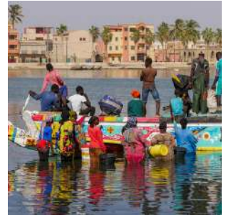
Fishermen in Saint-Louis

*Navigation on some dates will be in the opposite direction